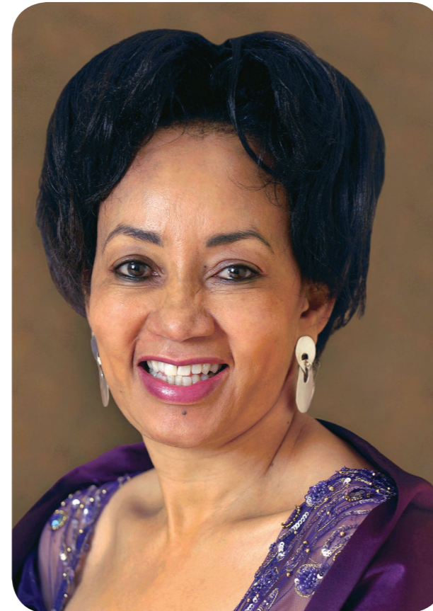
Minister Lindiwe Nonceba Sisulu Department of International Relations and Cooperation

Through the ARF, we will continue with our commitment to the promotion of democracy and good governance with a view to enhance public participation and accountability. These are important elements for socio-economic development and integration as well as achieving continental prosperity. In this regard, the sustained and credible holding of free, fair and just elections with full public participation throughout the continent will enable us to achieve this objective.