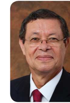
Deputy Minister Luwellyn Landers Department of International Relations and Cooperation