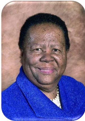
Minister Naledi Pandor

The Revised Strategic Plan 2015 – 2020 and the Annual Performance Plan (APP) 2019 – 2020 of the African Renaissance and International Cooperation Fund (ARF) provide details of the fund's immediate and long-term objectives. In order to give effect to these important objectives, the APP contains a specific and measurable set of targets.