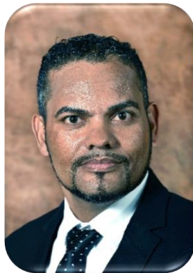
Deputy Minister Alvin Botes