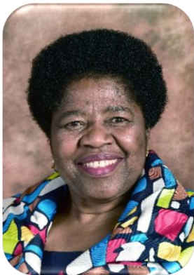
Deputy Minister Candith Mashego-Dlamini

We continue to experience an increase in natural disasters. Clearly, erratic weather patterns, which are largely the result of climate change effects, require our urgent attention. This fund enables us to be counted among those who strive to restore human dignity and bring relief to people in distress as and when humanitarian situations arise.