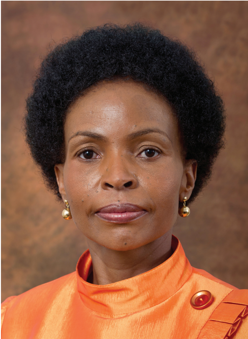
Minister Maite Nkoana-Mashabane Minister of International Relations and Cooperation