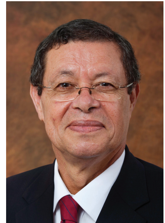
Luwellyn Landers Deputy Minister of International Relations and Cooperation