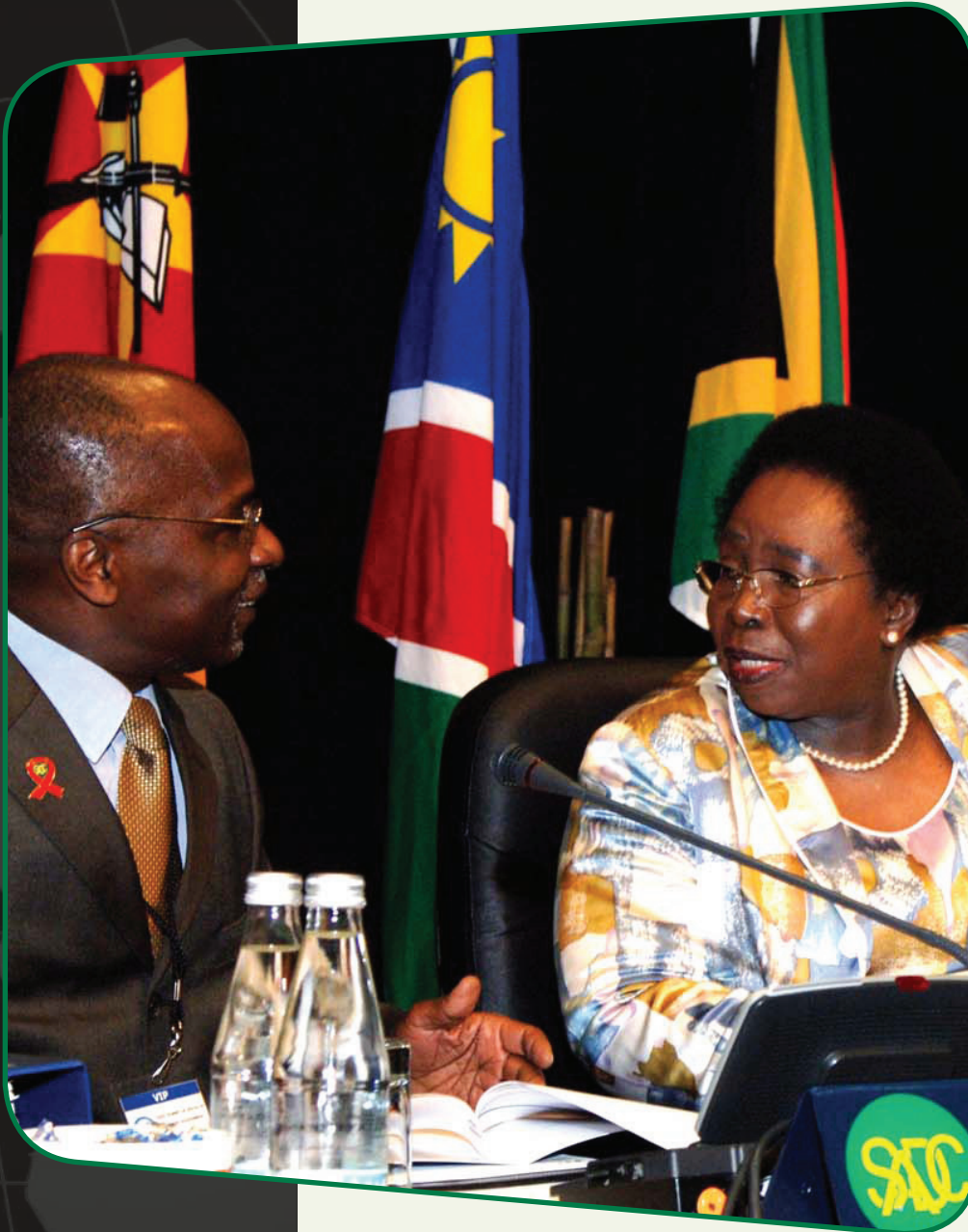
Minister of Foreign Affairs Dr Nkosazana Dlamini Zuma and SADC Executive Chair Dr Augusto Salomao at a SADC meeting

As part of its support to the operationalisation of the AU structures, South Africa remains committed to contribute towards the operationalisation of the African Court of Justice and the African Court on Human and People's Rights. The merger instruments for the two institutions were not released during the period under review and South Africa will consider the signing and ratification of these Instruments once released.