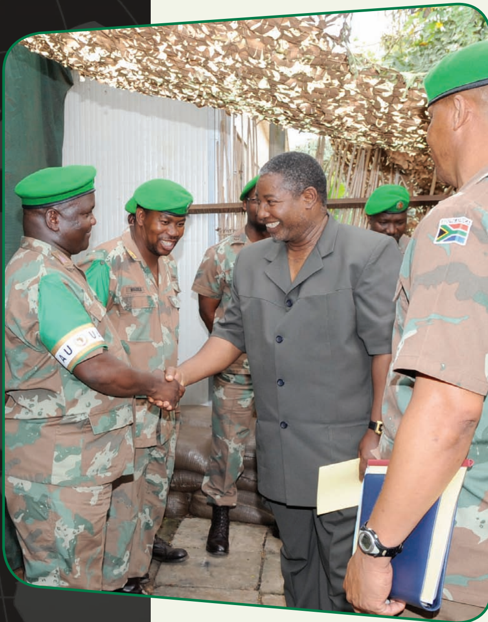
Minister of Defence Charles Nqakula greeting SA soldiers at the AU base in Burundi

expected to feed into the process of revising the White Paper on South Africa's participation in international peace missions.