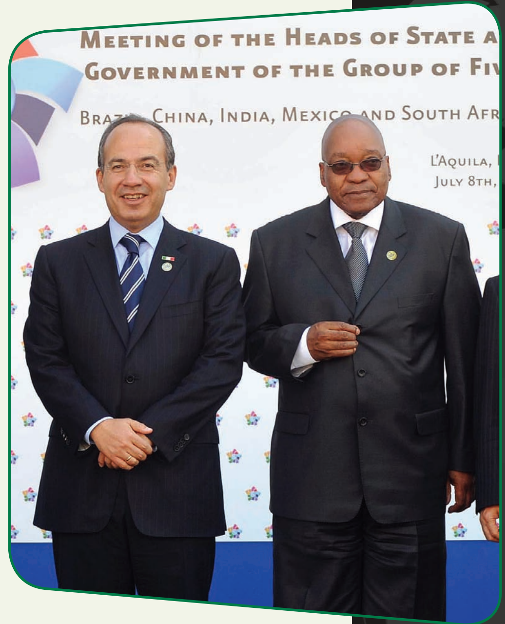
President Jacob Zuma with Mexican President Felipe Calderón at the G5 meeting in Italy

South Africa engages with the G8 in the context of the African and the G5 Outreach programmes to promote the African Agenda and contribute to the development of a more equitable system of global governance. During the 2008 G8 Hokkaido Summit held in Japan, South Africa prioritised the implementation of past G8 commitments to Africa whilst pressing for adequate and effective responses to address challenges of food and energy security in Africa; presented a proactive