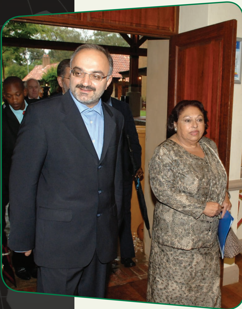
Deputy Minister of Foreign Affairs Fatima Hajaig with the Deputy Minister of Economic Affairs and Finance of Iran Dr Behrouz Alishihri, during a bilateral meeting held in Pretoria

government in Israel. Concerning the Israeli invasion, the South African Government remained abreast of developments and issued numerous press statements in response to the Israeli military assault against Hamas in Gaza during November 2008 and January 2009. In these, the SA Government unequivocally condemned the Israeli military assault on Gaza and the death of almost 1,500 Palestinians, the majority being women and children. The Department also facilitated humanitarian assistance to the people of Gaza following the Israeli assault, such as that arranged by the Gift of the Givers, the Southern African Catholic Bishops Conference, the South African Council of Churches, Cosatu as well as other SA non-governmental organisation.