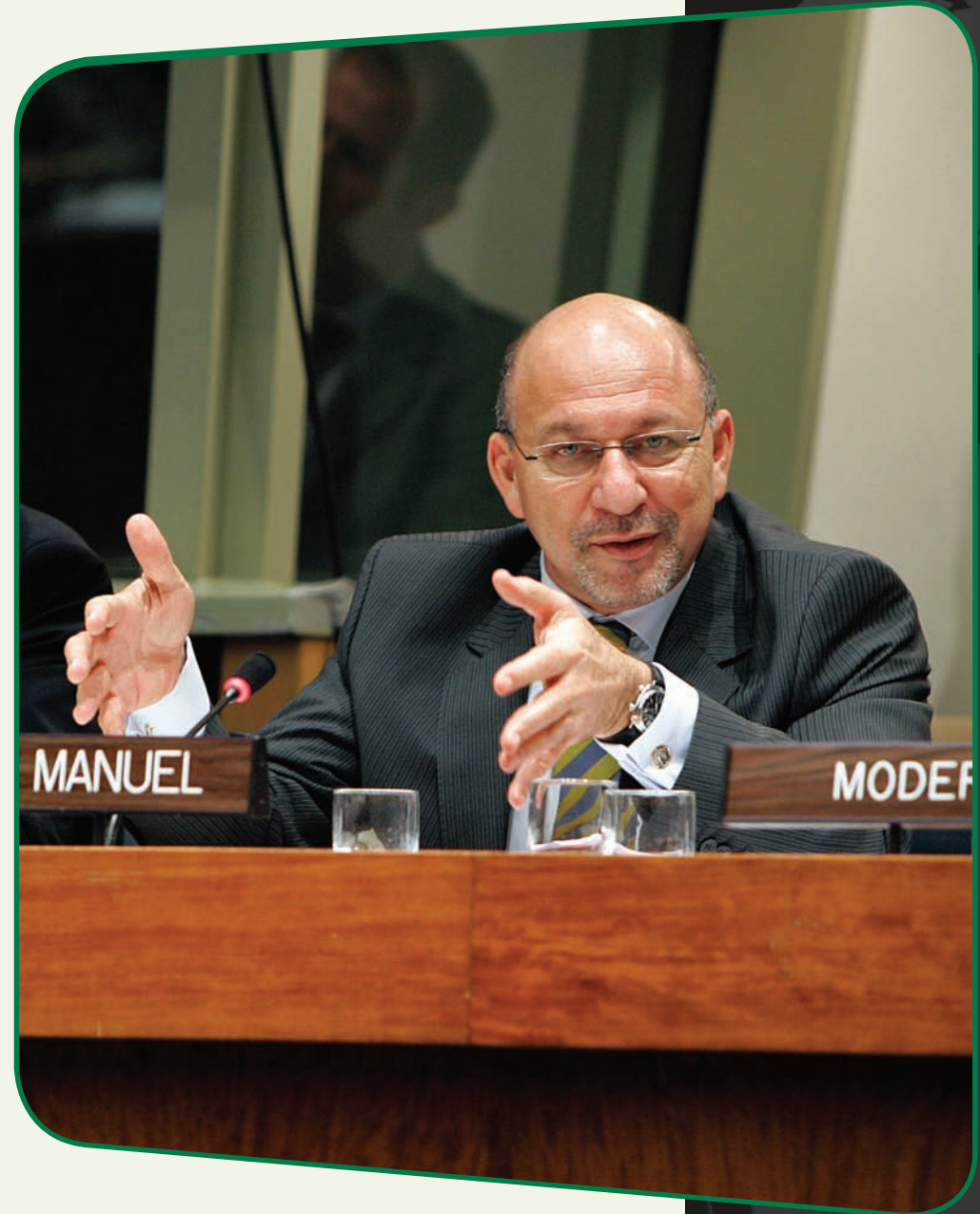
Minister of Finance Trevor Manuel at the Doha Review Conference

The Department convened regular meetings of the Expanded UN Working Group, as part of the process of co-ordinating South Africa's preparations for participation in the UNCTAD XII Conference which was scheduled to be held in Accra, Ghana from 20 to 25 April 2008.