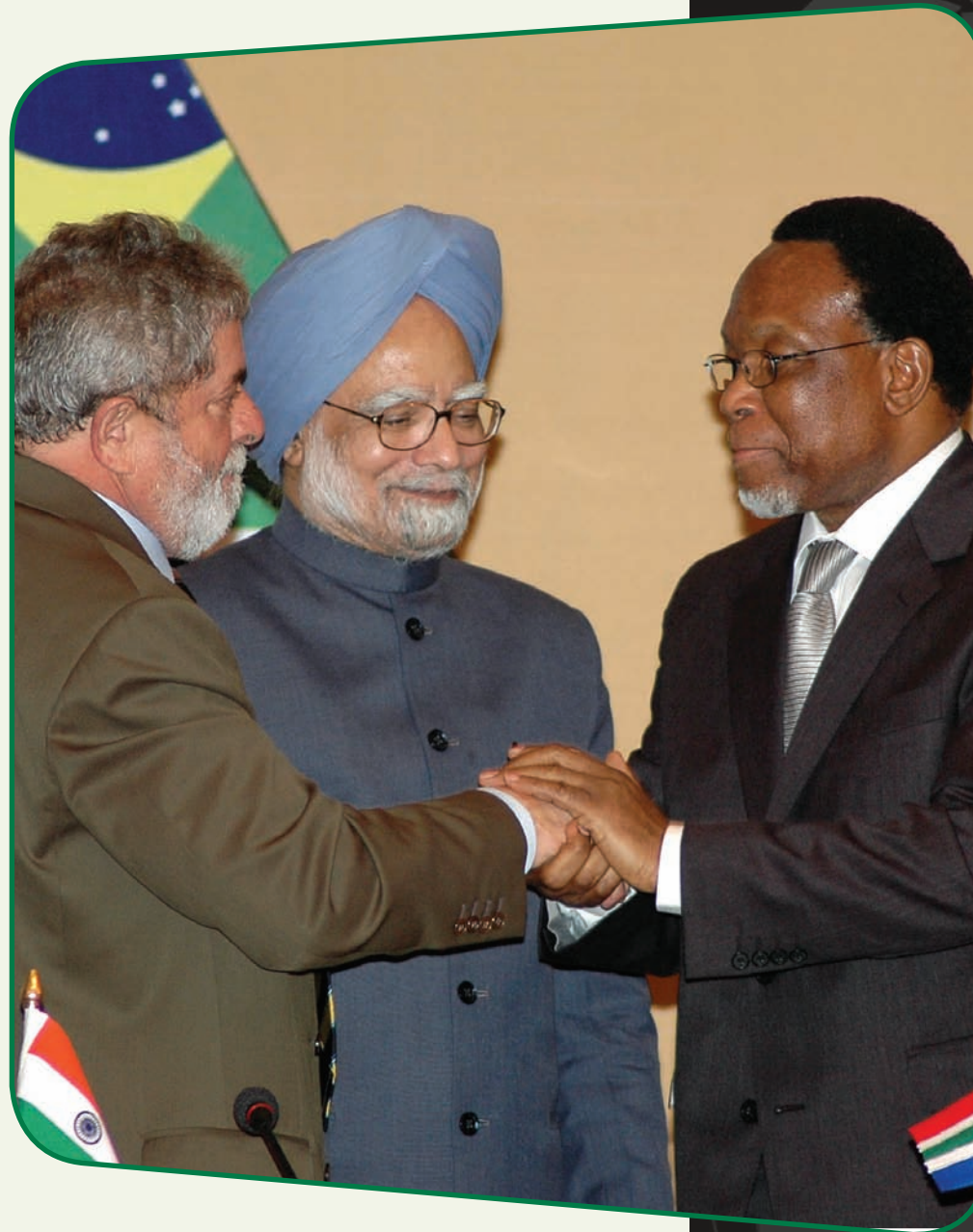
Former President Kgalema Motlanthe with Brazilian President Luiz Inácio Lula da Silva and Prime Minister Manmohan Singh during the 3rd IBSA Summit, New Delhi, India

After years of a decline of interest, a positive mood has begun to emerge at all IOR-ARC meetings. The 8TH Council of Ministers that took place from 29 April to 4 May 2008 in Iran, approved a recommendation by the Committee of Senior Officials that the Working Group of Heads of Missions (WGHEM), merited continuity as it was a useful tool for the Association