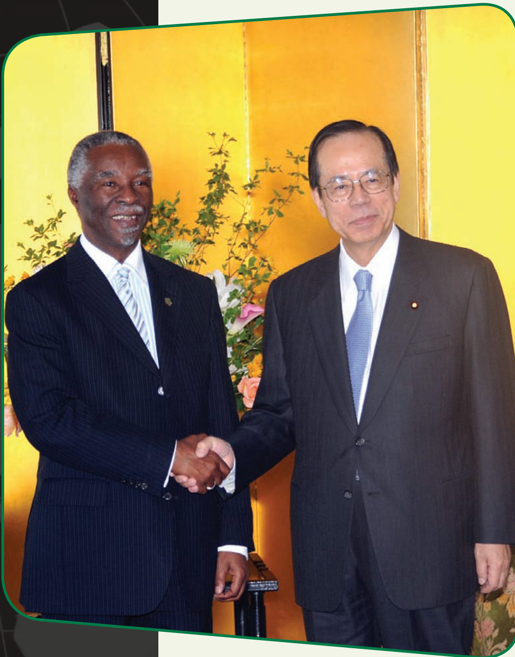
Former President Thabo Mbeki with Japan's Prime Minister Yasuo Fukuda during a TICAD meeting

UNCTAD XII was held in Accra, Ghana, from 20 to 25 April 2008 under the overall theme “Addressing the opportunities and challenges of globalization for development”. The South African delegation was led by Trade and Industry Deputy Minister Rob Davies. South Africa's position was informed by the preliminary work done by the Expanded UN Working Group in Pretoria, which was chaired by the Department, which co-ordinated the inter-departmental preparations for the conference. Throughout its participation, the South African delegation supported UNCTAD's mandate of addressing the key global economic needs particularly of developing countries, given the growing importance of regional and interregional initiatives.