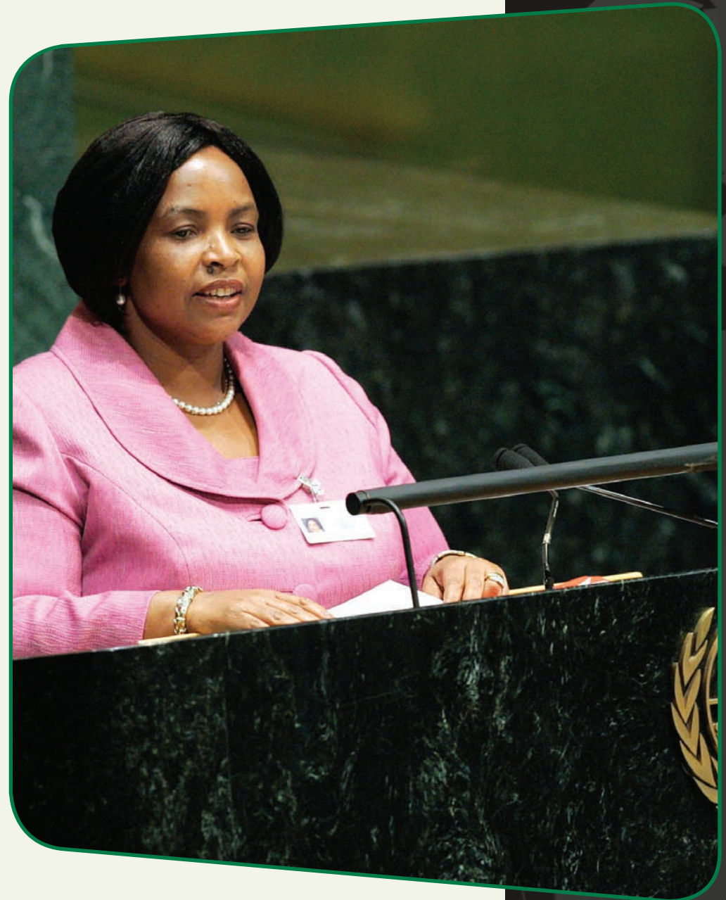
Minister of International Relations and Cooperation Maite Nkoana-Mashabane addressing the United Nations Conference on the World Financial and Economic Crisis and Its Impact on Development

During her second year as non-permanent member of the Security Council, South Africa continued to prioritise the promotion and safeguarding of multilateralism and the observance of international law. South Africa also continued her active participation in a full range of thematic and country specific issues, including the work of the subsidiary bodies of the Security Council, which are designed to enable the Council to explore some issues in greater depth, to monitor/facilitate implementation of some of its decisions and to oversee the implementation of sanctions.