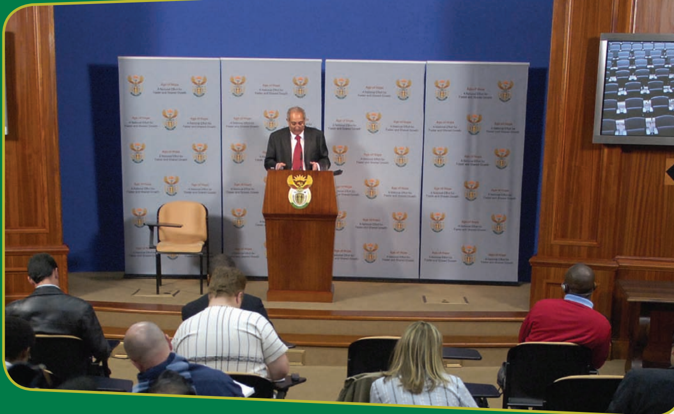
Deputy Minister of Foreign Affairs Aziz Pahad briefing the media at the media centre, Union Buildings, Pretoria