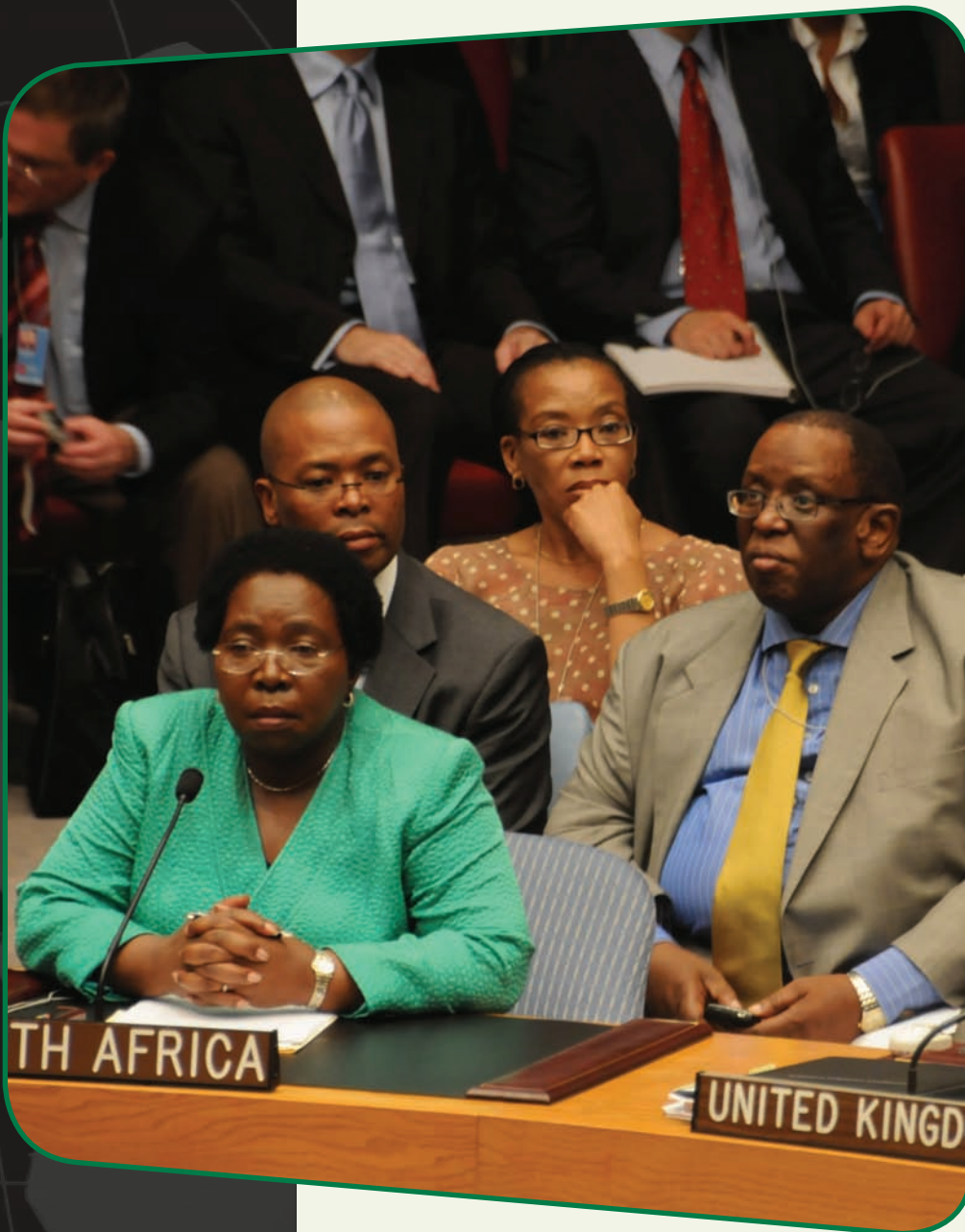
Minister of Foreign Affairs Dr Nkosazana Dlamini Zuma with Department's officials at the United Nations, New York

During the reporting period, South Africa paid particular focus to African issues that were on the agenda of the Security Council in line with its foreign policy objectives to support conflict resolution, reconciliation, reconstruction and development activities on the African continent. South Africa directly and positively influenced a number of Council resolutions and presidential statements on these issues.