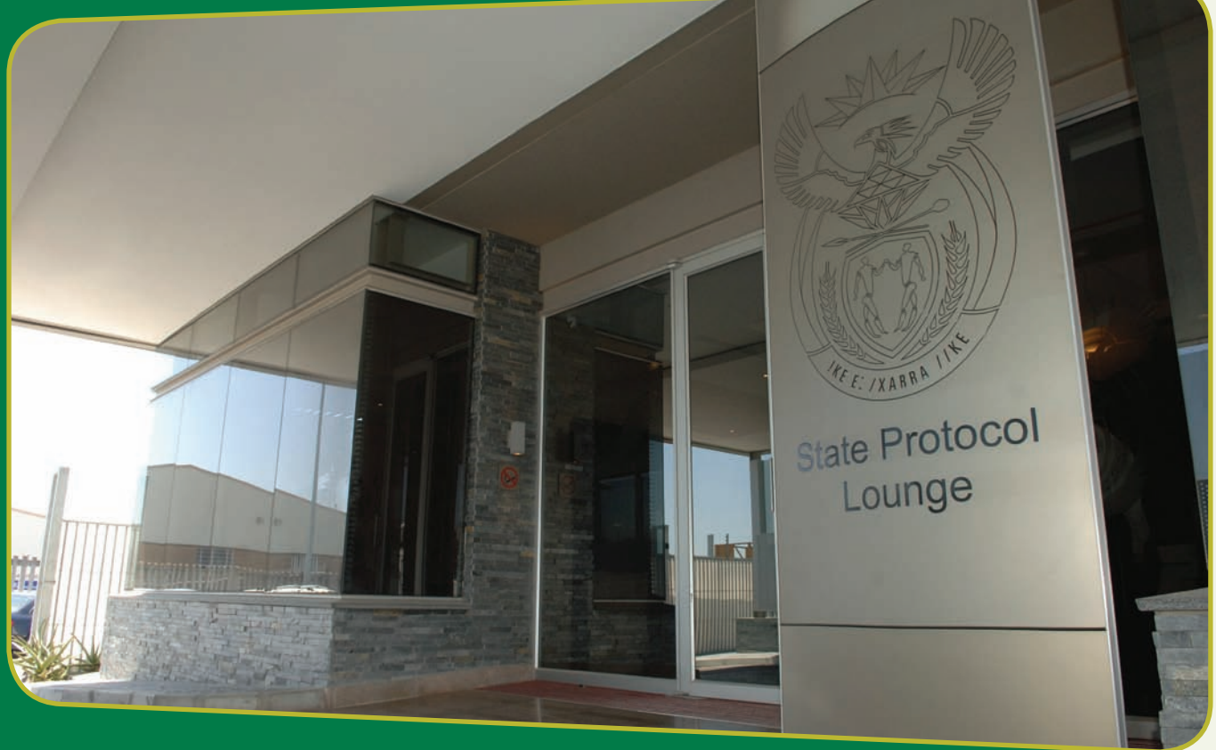
Cape Town State Protocol Lounge