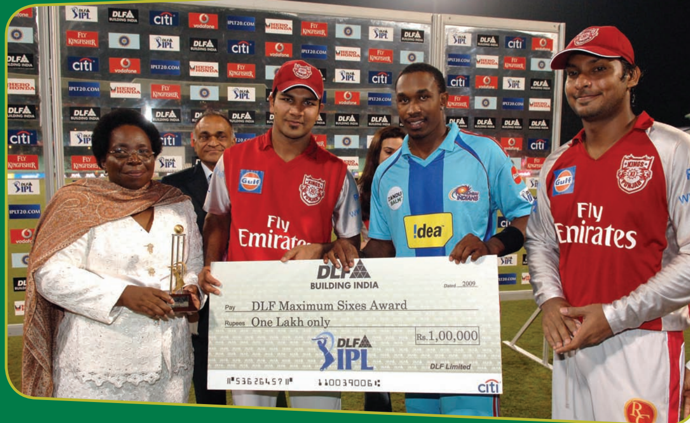
Minister of Foreign Affairs Dr Nkosazana Dlamini Zuma during the prize handing over ceremony after the match between the Kings Punjab and the Mumbai Indians in Durban

Movement (SPLM). During the reporting period, South Africa's former President Thabo Mbeki has been leading the AU High Level Panel on Darfur. In this regard South Africa continued to support the efforts of the AU High Level Panel on Darfur as well as the UN, Qatar and the Arab League initiatives.