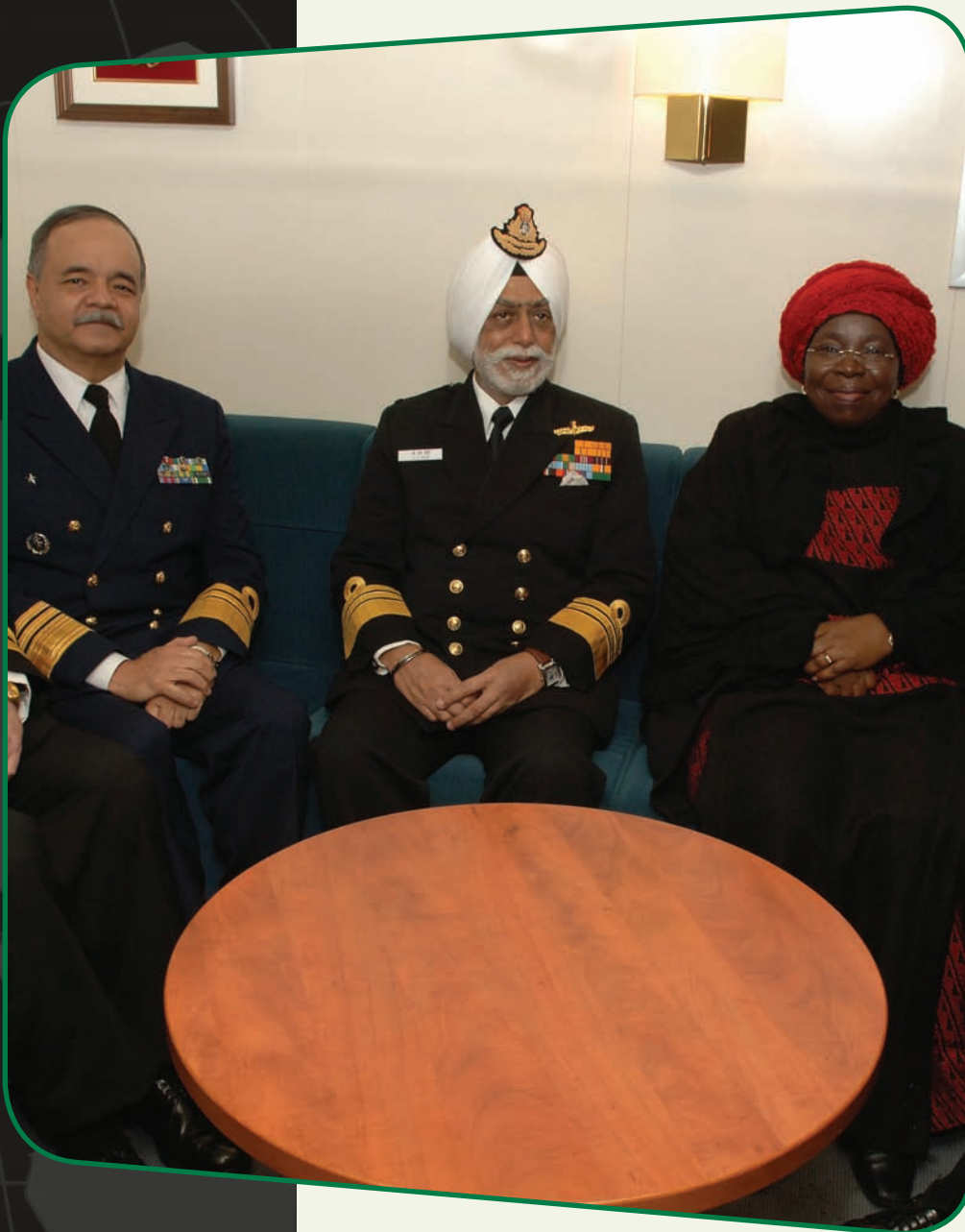
Minister of Foreign Affairs Dr Nkosazana Dlamini Zuma with Indian Vice Admiral Jagjit Singh Bedi and Brazilian Vice Admiral Joao Alfonso Maia de Faria during the IBSA naval exercise

as was demonstrated by the Sun City Outcome Document of the Extra-Ordinary Meeting held at Sun City in January 2008. The implementation of the Sun City Outcome document is starting to achieve results. A small number of projects are currently being focused on with a good chance of success. Firstly, South Africa participated at a meeting in Oman to discuss the establishment of a Maritime Transport Council. During these discussions, South Africa succeeded in including a representative from the African Maritime Charter in the proposed Maritime Council with the status of an observer. A Senior Officials' meeting is scheduled to take place in June 2009, in South Africa. Secondly, the establishment of the Fisheries Support Unit (FSU) has attracted nine of the 18 member countries during the meeting in Oman to discuss the implementation of the FSU. Yemen takes over as the new IOR-ARC Chair in mid 2009 and India as the Vice-Chair.