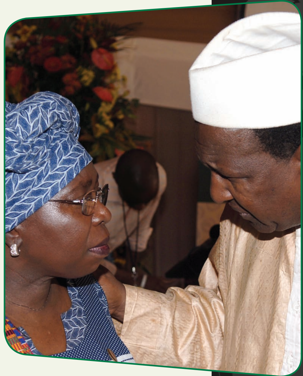
Minister of Foreign Affairs Dr Nkosazana Dlamini Zuma and Chairperson of the African Union Commission Professor Alpha Konare during the 10th Extraordinary Session of the Executive Council held at Zimbali Lodge, Durban

South Africa participated in the African Union Council of Ministers in January 2009 during which discussions were held with regard to the progress made by PAP since its establishment five years ago. Particular emphasis was placed on PAP's readiness to progress from an advisory body to a legislative institution. South Africa will continue to engage with the members of PAP directly or through South Africa's Parliamentary representatives in PAP to ensure that these discussions are completed.