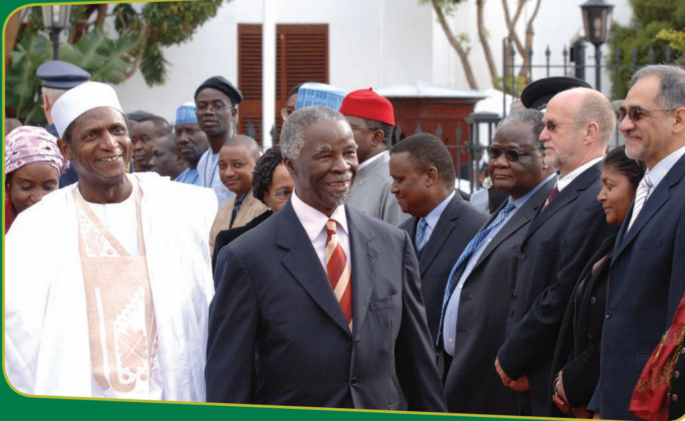
Former President Thabo Mbeki with Nigerian President HE Alhaji Umaru Musa Yar'Adua during the latter's State Visit to South Africa