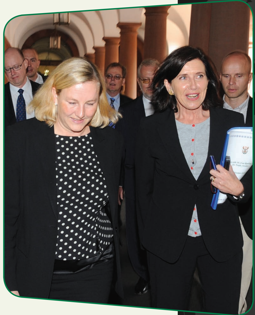
Deputy Minister of Foreign Affairs Sue van der Merwe with the Minister of Foreign Trade of Sweden, Dr Ewa Bjorling

Co-operation between South Africa as host of the 2010 FIFA Soccer World Cup and the UK as host of the 2012 Olympic Games continued during the reporting period with reciprocal visits and exchanges. The UK agreed to fund assistance for sustainable training grounds and facilities.