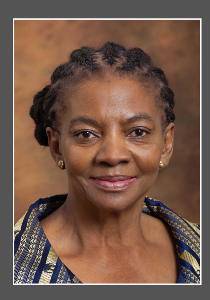
Nomaindiya Mfeketo Deputy Minister of International Relations and Cooperation

South Africa pursues the African Agenda, conscious that the Global System of Governance is not efficient and representative of all the people and demographics of the