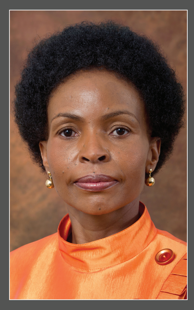
Maite Nkoana-Mashabane Minister of International Relations and Cooperation