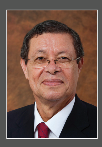
Luwellyn Landers Deputy Minister of International Relations and Cooperation