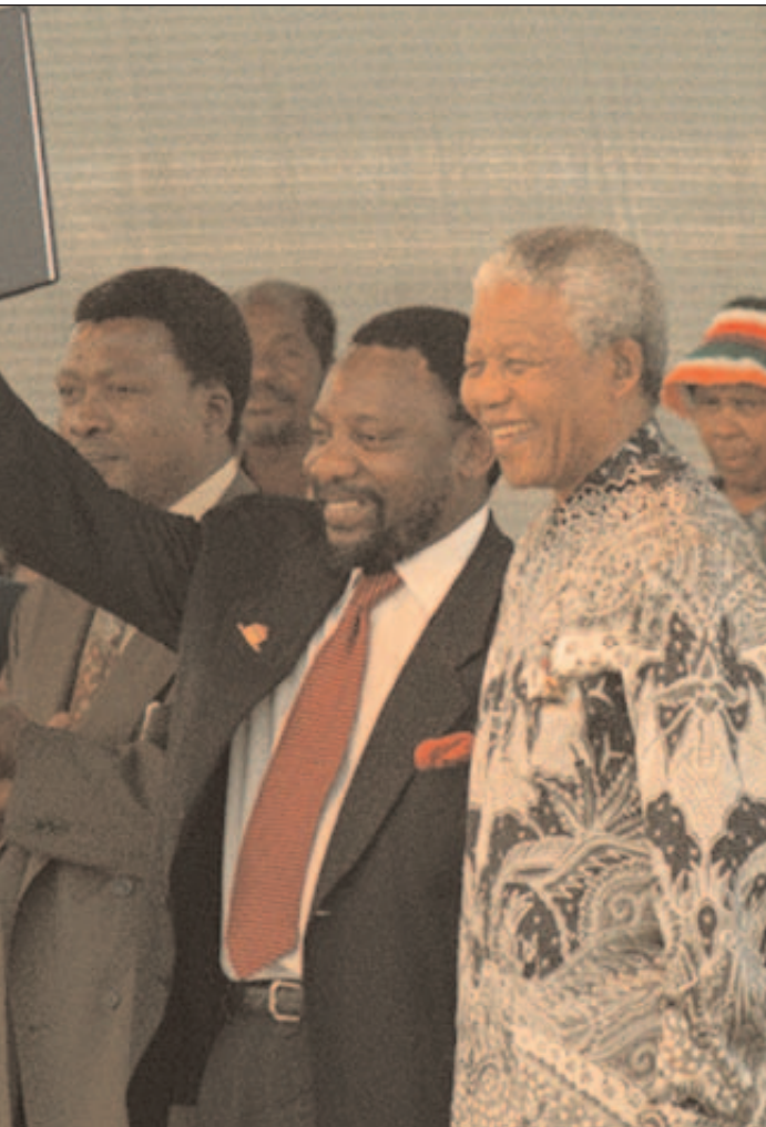
Former President Nelson Mandela and Cyril Ramaphosa Celebrating the launch of South Africa's first ever democratic Constitution

lation and conduct of South Africa's foreign policy and relations.