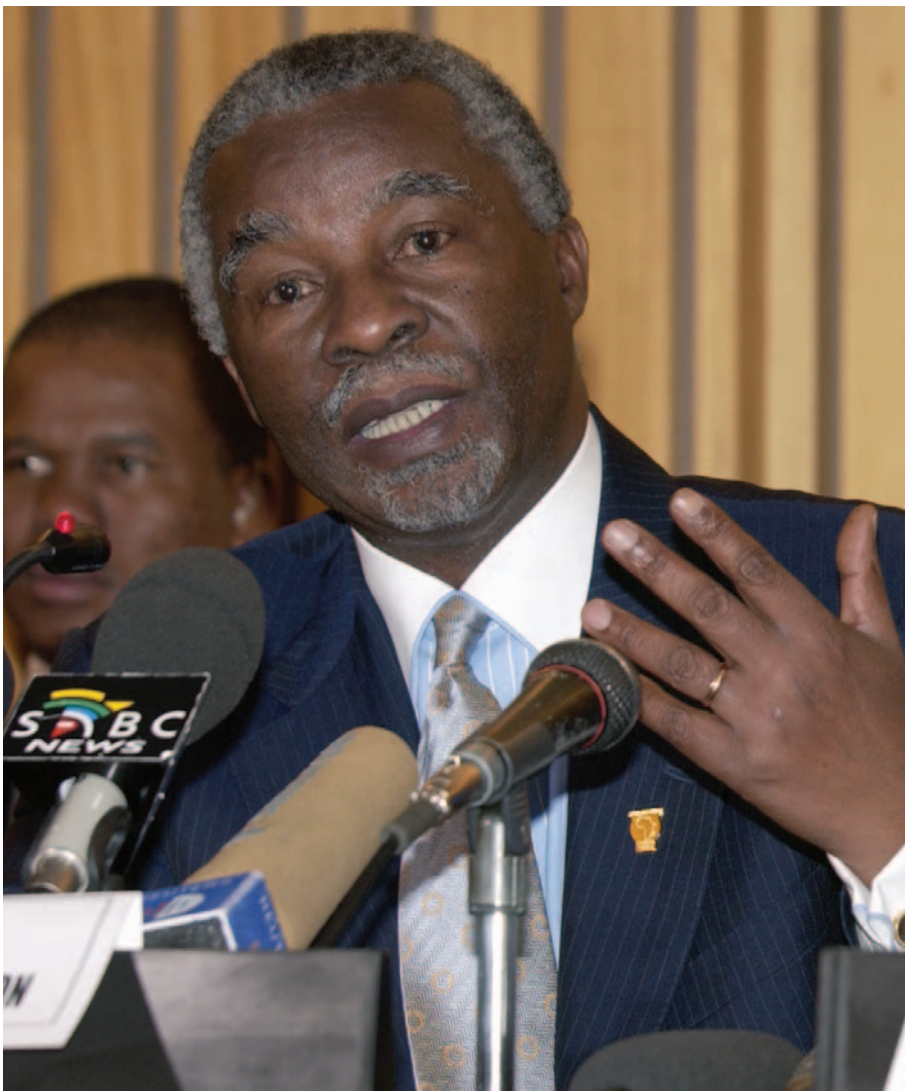
President Thabo Mbeki Addresses a press conference during the First Extraordinary summit of the Assembly of the African Union Addis Ababa Ethiopia 3-4 February 2003

This strategic plan sets out the key areas of focus consistent with priorities identified in the recent Cabinet Lekgotla and sets the basis for cooperative interaction between our Department and other institutions and organs of State.