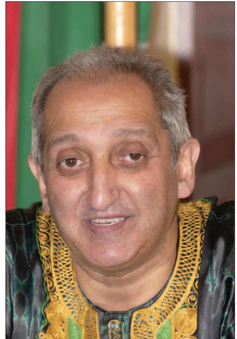
Deputy Minister of Foreign Affairs, Aziz Pahad

Furthermore, global governance is challenged by the undermining of