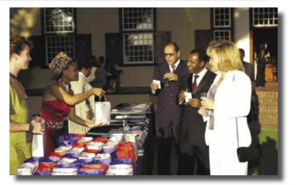
Guests arriving at the Department's annual opening of Parliament function in honour of the Diplomatic Corps.

the grounds of the Union Buildings. Other participating stakeholders included the foreign Missions accredited to South Africa, the City of Tshwane, and a number of Corporate Sponsors. Funds totaling R50 000 were raised on the day and donated to earmarked charities at a function held at the State