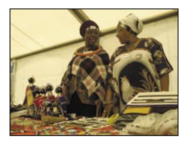
Department's JFSOC co-ordinated the 7<sup>th</sup> International Fair held in Pretoria.

7th International Fair, in Pretoria, 2 November 2002. The Department's Junior Foreign Service Officers Committee (JFSOC) co-ordinated the 7th International Fair held at