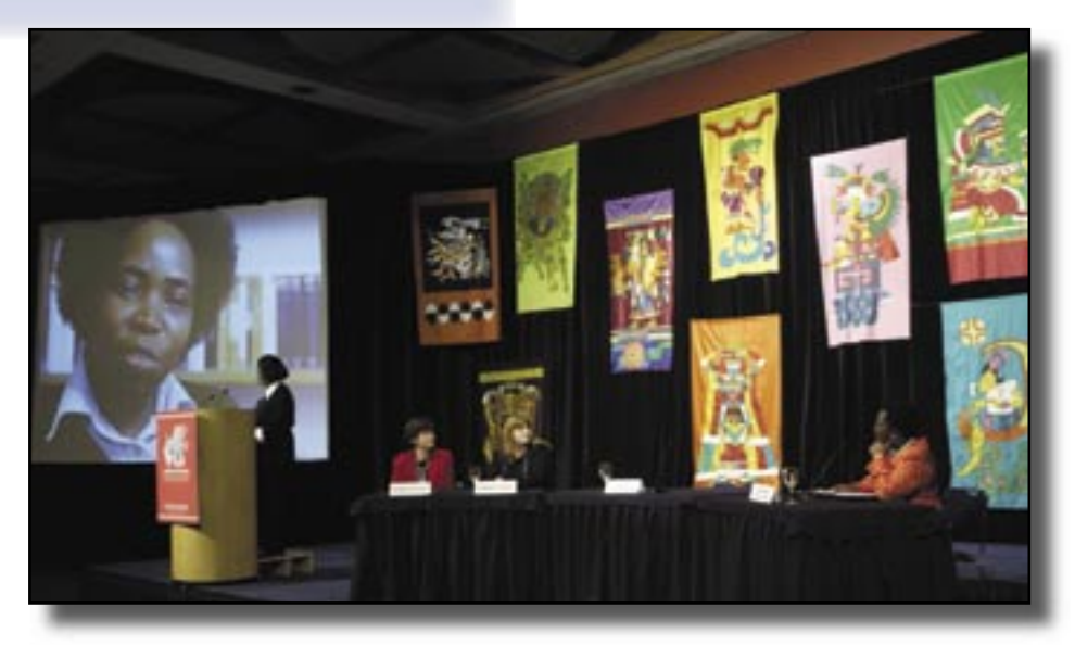
Delegates to the International Women's Federation Conference in Mexico City watching a video produced by the Department.

• The WSSD, from 17 August to 2 September 2002. The Department, together with other Government Departments, formed part of the South African Pavilion in Ubuntu village from 17 August to 2 September 2002. The stand was specifically designed to promote and showcase the Department's achievements as well as the major conferences co-ordinated since 1994, namely, UNCTAD, CHOGM, NAM, WCAR, and the launch of the AU and its program of action - NEPAD. During the event, the Department's stand won 'the Best Small Exhibition' award.