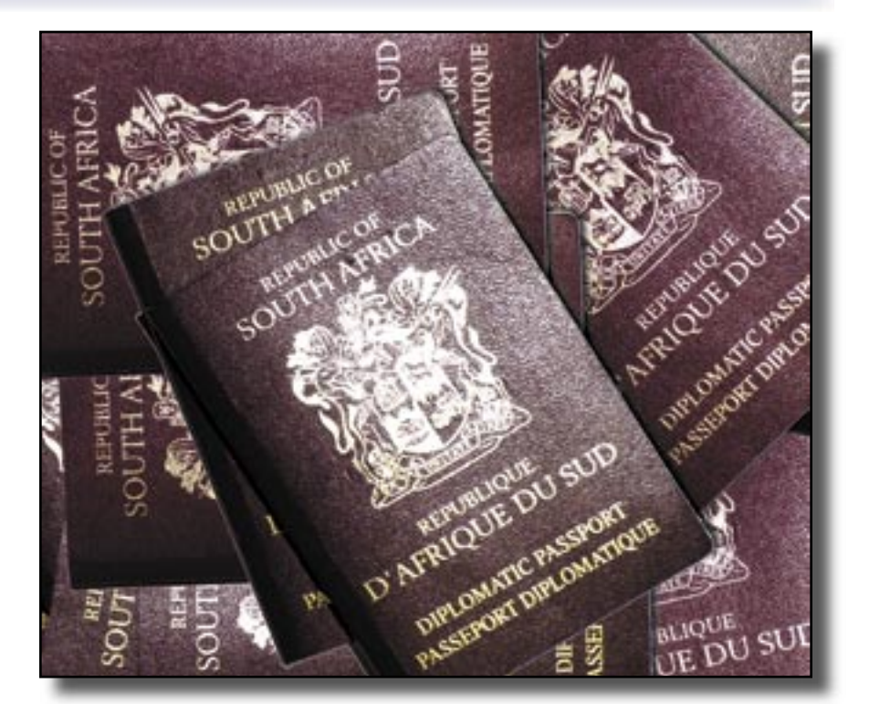
The Department continued to facilitate travel documents for diplomatic and official passport holders nationally.

Missions are exempted from transfer duties and municipal rates in respect of properties for offices and residences for Heads of Mission. During 2002/03, the Department paid R7, 3 million to local authorities in respect of diplomatic property taxes and R44 million in terms of VAT refunds.