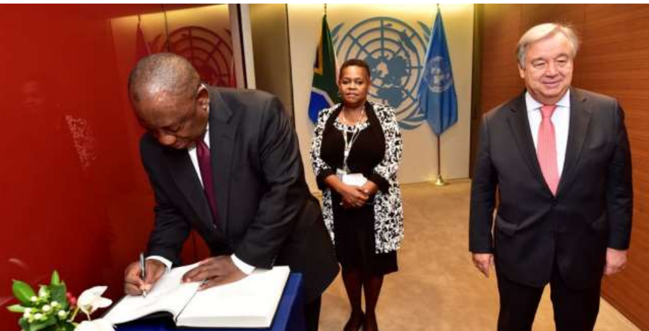
President Ramaphosa signing the visitors book at UN Headquarters in New York.