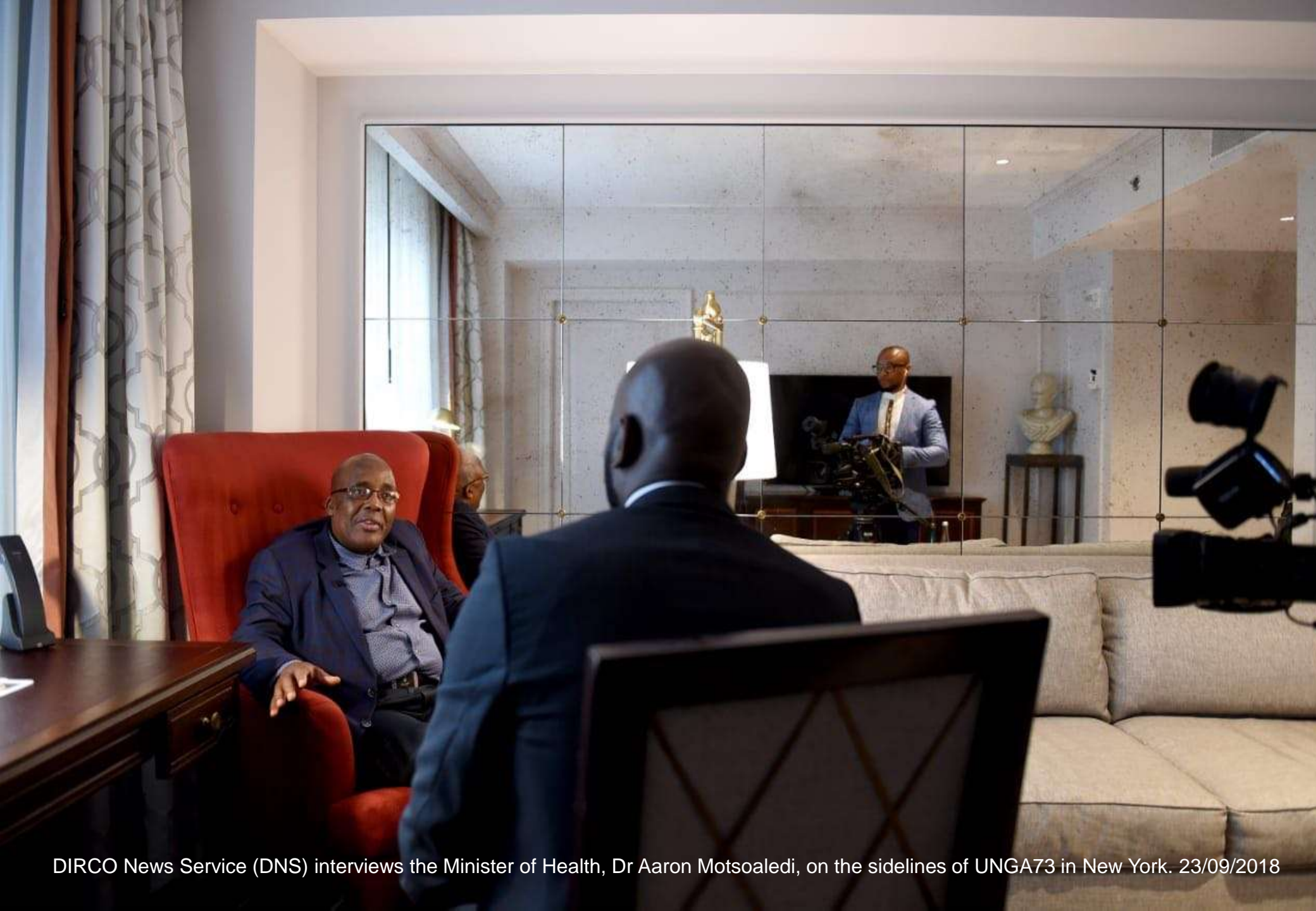
DIRCO News Service (DNS) interviews the Minister of Health, Dr Aaron Motsoaledi, on the sidelines of UNGA73 in New York. 23/09/2018