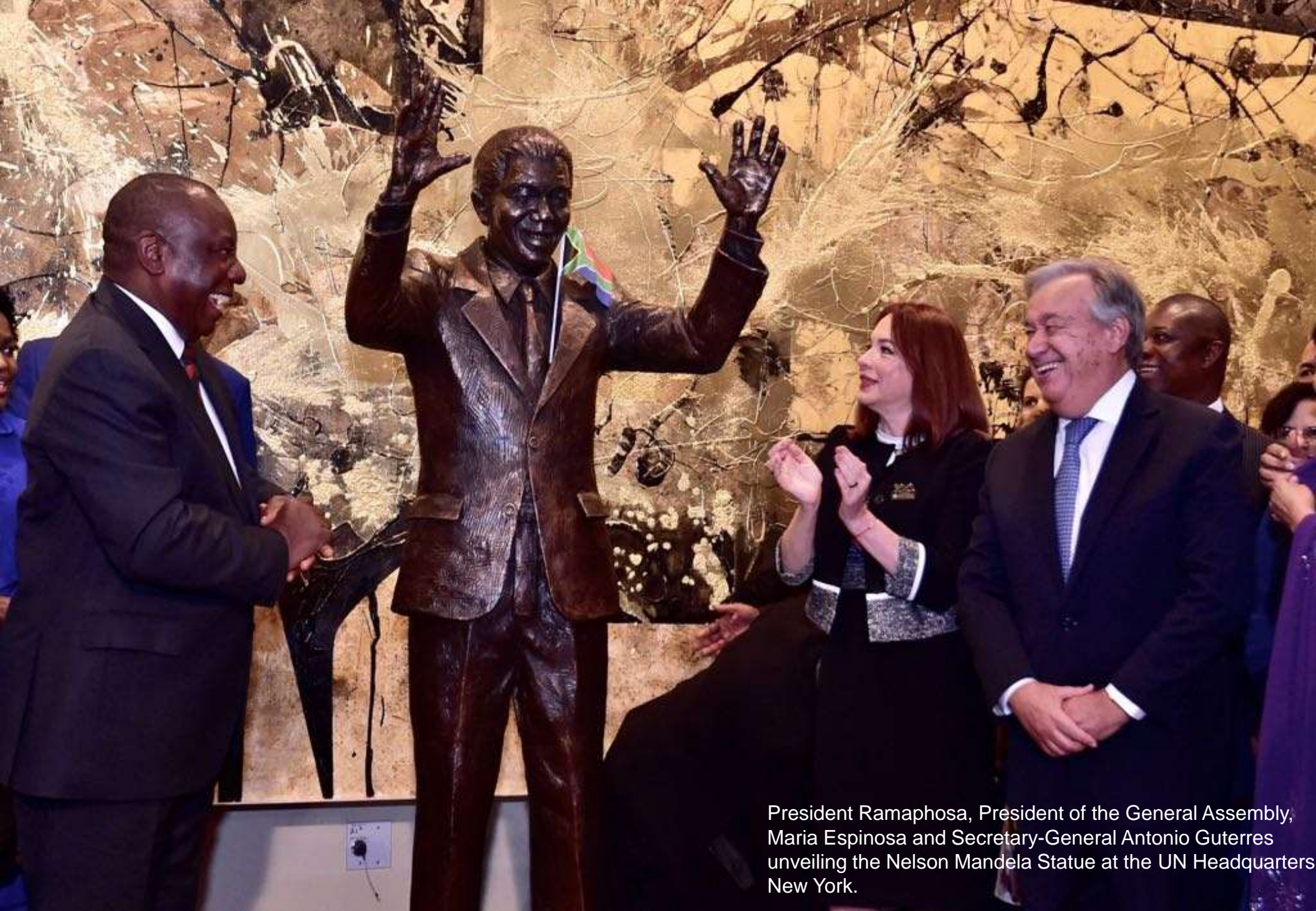
President Ramaphosa, President of the General Assembly, Maria Espinosa and Secretary-General Antonio Guterres unveiling the Nelson Mandela Statue at the UN Headquarters New York.