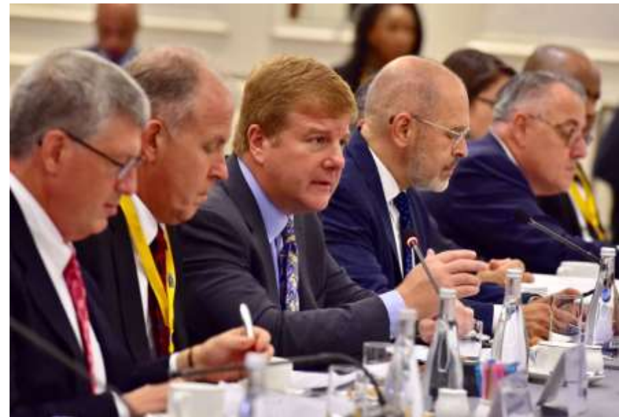
President Ramaphosa addressing the CEO Roundtable Discussion during the Trade and Investment Promotion segment at the Intercontinental Hotel in New York.