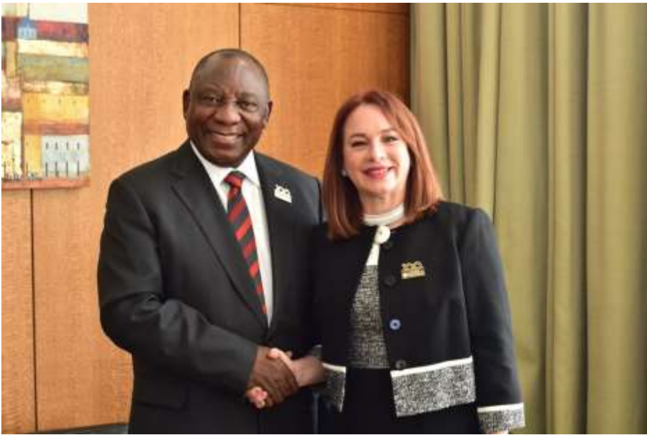
President Ramaphosa with the President of the General Assembly, Maria Espinosa ,during a bilateral meeting.