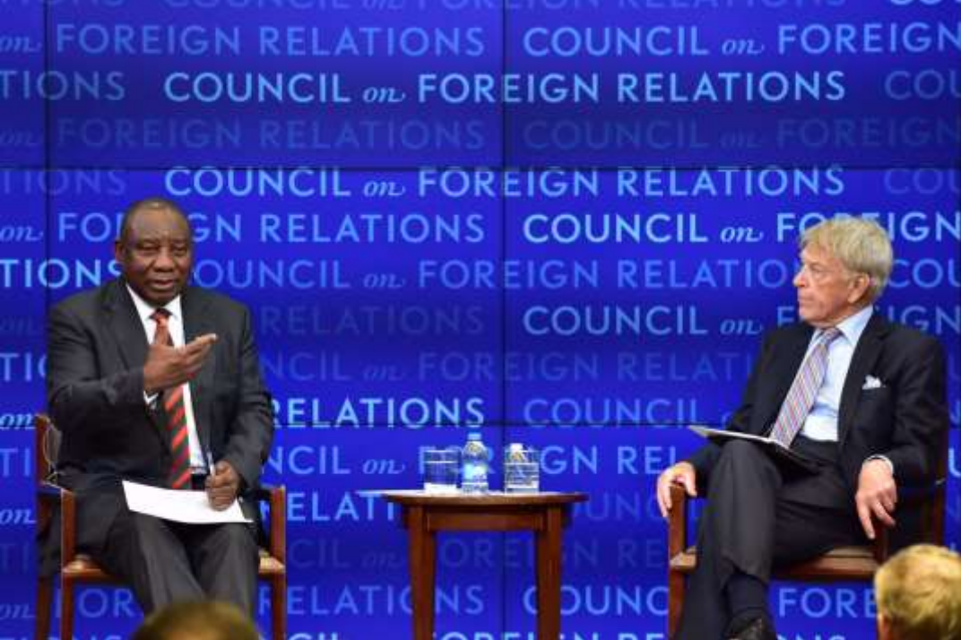
President Ramaphosa addresses the Council on Foreign Relations (CFR) meeting at the Council Offices in New York.

The CFR is an independent, non-partisan membership organisation, think-tank and publisher dedicated to being a resource for its members, government officials, business executives, journalists, educators and students, civic and religious leaders, and other interested citizens in order to help them better understand the world and the foreign policy choices facing the United States and other countries.