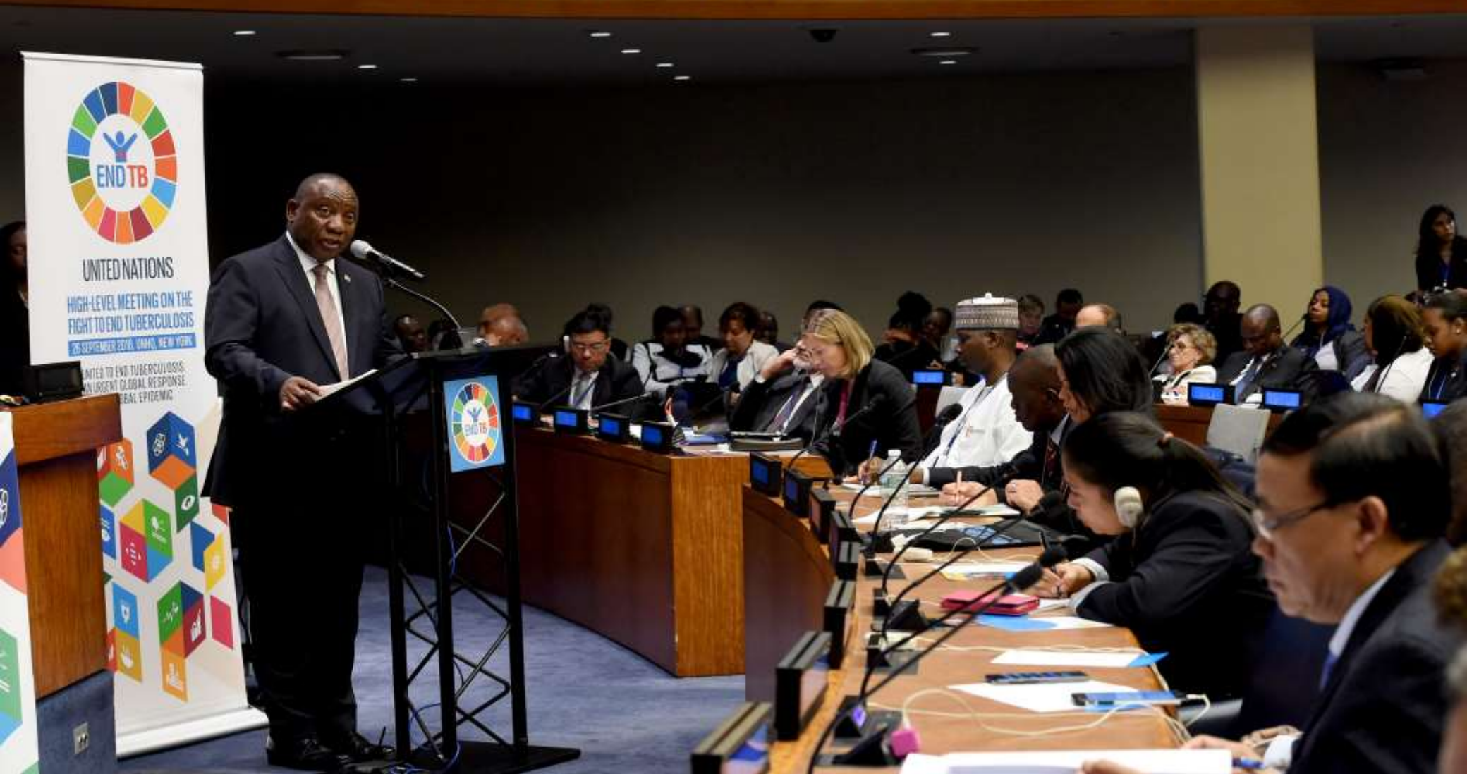
President Ramaphosa addressing a High-Level Meeting on the fight against tuberculosis, convened by Maria Fernananda Spinosa, the President of the 73rd Session of the UNGA, UN Headquarters, New York. 26/09/2018.