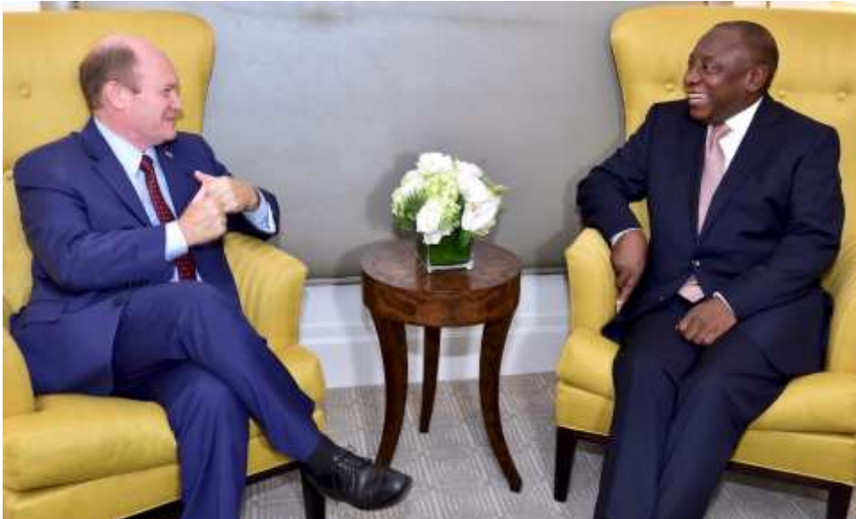
President Ramaphosa and Senator Christopher Coons during a bilateral meeting at the Intercontinental Hotel in New York.

Senator Coons is the Vice-Chair of the Senate Ethics Committee and a member of the Senate Foreign Relations Committee.