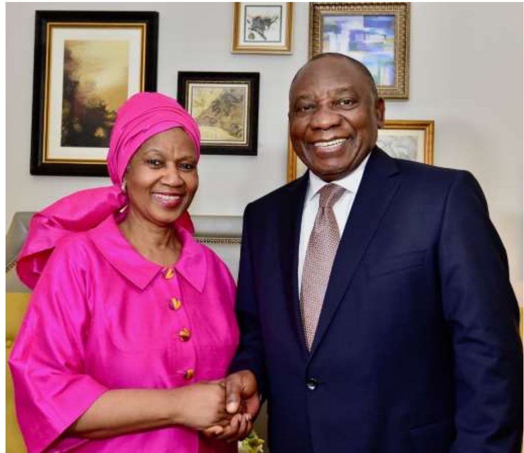
President Ramaphosa and the Executive Director of UN Women, Phumzile Mlambo-Ngcuka, during a bilateral meeting.