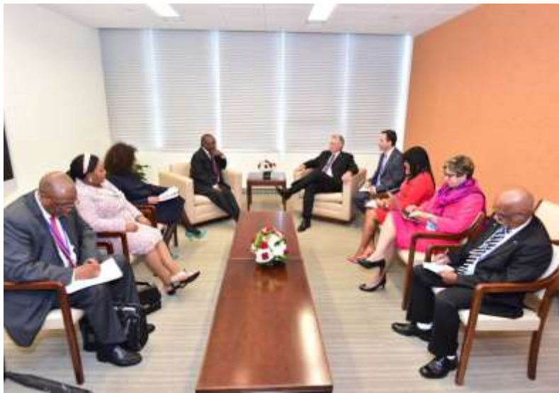
President Ramaphosa and the President Miguel Daiz-Canal of the Republic of Cuba, during a bilateral meeting at the UN Headquarters in New York.