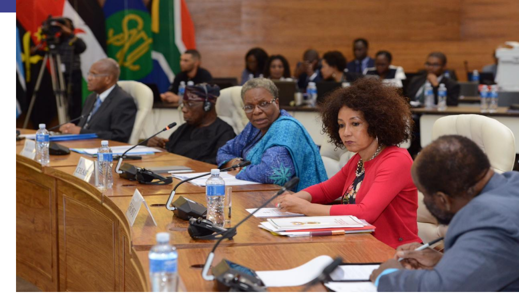
The opening of the SADC Solidarity Conference Ministerial Preparatory Meeting, 25 March 2019