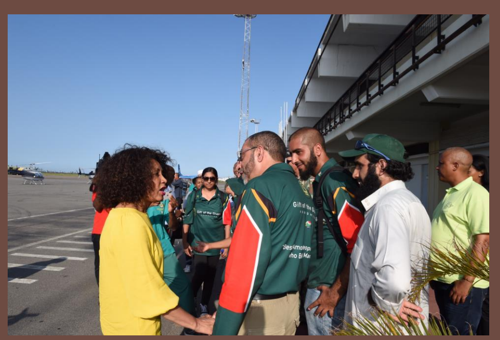
Minister Sisulu meets with Dr Imtiaz Sooliman and team from Gift of the Givers on arrival

In March 2019, the vicious Cyclone Idai hit Beira, the fourth largest city in Mozambique, it arrived in Malawi and continued its devastation in Zimbabwe leaving the three South African neighbours in a state of complete disaster. Following the aftermath of the destruction, the Minister of International Relations and Cooperation, Lindiwe Sisulu called for humanitarian assistance from South African businesses, NGO's and individuals.