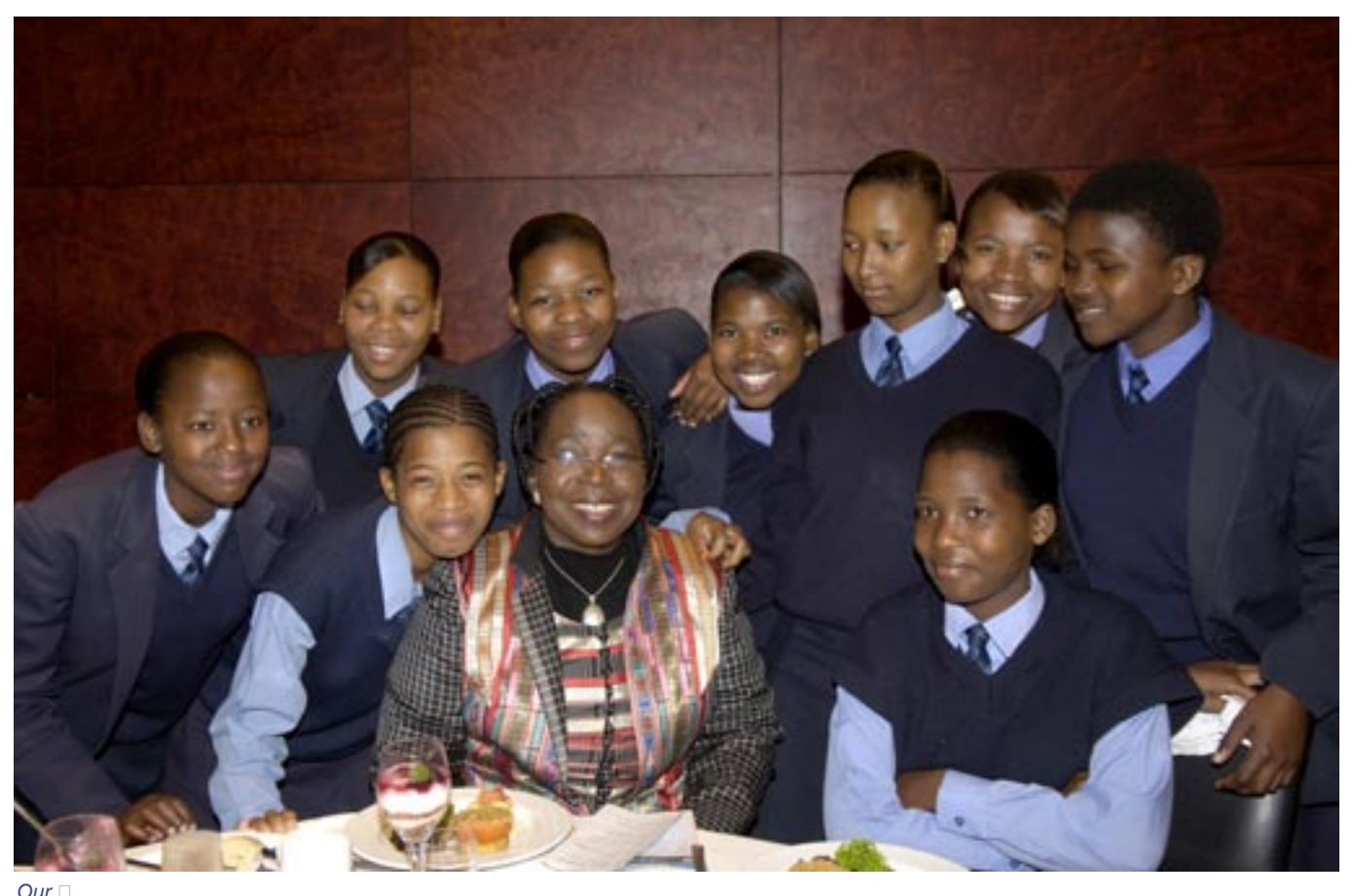
the Department for 'Take a girl child to work day'.

HE DEPARTMENT HAS ONCE AGAIN PARTICI-PATED in the annual "Take a Girl Child to Work Day" held on 25 May 2006. Under the theme- Nurturing self esteem. The campaign initiated by Cell C and endorsed by Departments of Education; and Communication, is supported nation-wide. It aims to expose girl children to various occupations, thus broadening their career choices. This is the Department's second year of participation, following a very successful and well-supported event last year. The Department hosted 20 girls from Kgomotso Comprehensive High School in Soshanguve, Pretoria accompanied by their two teachers.