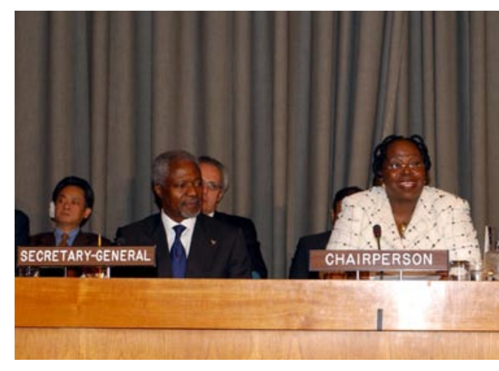
Minister of Foreign Affairs, Dr Nkosazana Dlamini Zuma with the UN Secretary-General, Kofi Annan chairing a G77 and China meeting in New York, March 2006.

In summing up the debate, Deputy Minister Aziz Pahad said the many statements indicated that the G77 and China were united in its broad approaches. He added that there was need to put to rest the misconception that the G77 is not committed to UN