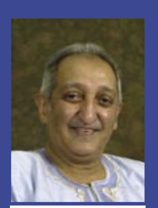
Deputy Minister of Foreign Affairs, Aziz Pahad.

Recently, South Africa chaired the Special Ministerial Meeting of the Group of 77 and China. The meeting took place on the margins of the NAM Ministerial Meeting on 29 May 2006 in Putrajaya, Malaysia. The South African Government was represented by Deputy Minister Pahad, who led the South African delegation and also chaired the Special Ministerial Meeting.