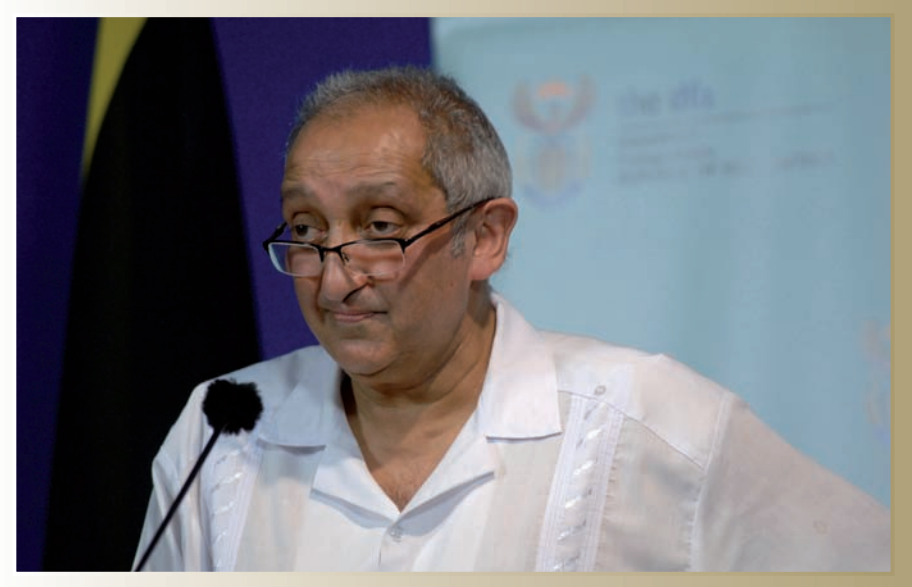
Deputy Minister Aziz Pahad at the weekly media briefing

Since the last reporting cycle Regional Consultative Conferences