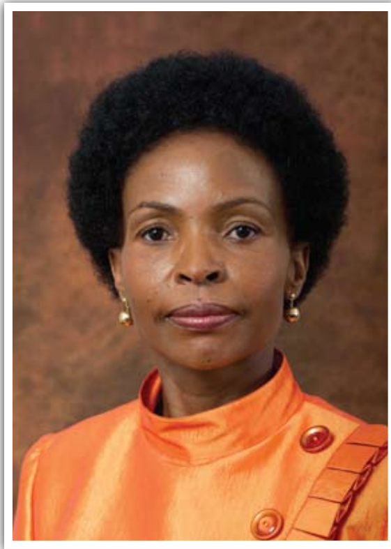
Minister Maite Nkoana-Mashabane