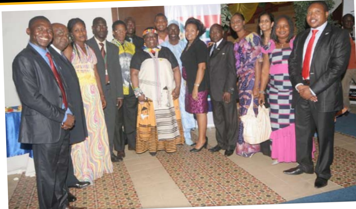
Ambassador NM Sibanda-Thusi, South African Ambassador to the Republic of Guinea, celebrating the 20th anniversary of Freedom Day along with Mission personnel

The South African Mission in the Republic of Guinea held the 20 Years of Freedom Day celebrations on Friday, 25 April 2014, at the Riviera Royal Hotel, Conakry. The event was officiated by the South African Ambassador to the Republic of Guinea, Nomasonto Maria Sibanda-Thusi. The Guinean Government was represented by Sanoussy Bantana Sow, Delegate Minister of Expatriate Guineans (Deputy Minister) who was the Guest of Honour. Minister Sow was accompanied by a number of senior government officials. Present were members of the Diplomatic Corps, international organisations' representatives, and political, economic, social and cultural strategic partners of the Mission. The Mission used the event to highlight the historical and cordial relations existing between the Republic of South Africa and the Republic of Guinea. The Mission reminded and informed the audience about the moral, political and international support and solidarity it received from the people of Guinea, the African continent and the world at large, especially the internationally organised Solidarity Movement. The Guinea Government reciprocated through its official statement accordingly. The Mission communicated and shared the achievements of the 20 Years of Freedom of the Republic of South Africa. These were in the domain of South Africa's revered Constitution, dedication to National Flag and other national symbols, democratic institutions, economy, education, health, etc.