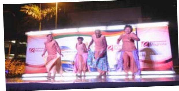
The Namjive dancers during their mall performance on 26 April 2014

As a continuation of the celebrations, the Namjive dancers also performed at the Robinsons Magnolia Mall on 26 April 2014, much to the delight of weekend shoppers. This was a perfect ending to the Embassy's three-day 20th Freedom Day celebrations.