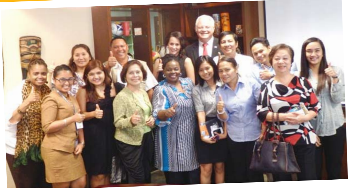
Participants of the Northern Cape Tourism Seminar held on 24 April 2014

The 20th Freedom Day celebrations commenced on 24 April 2014 with trade meetings of the Orange River Cellars with potential buyers and a tourism seminar. The latter was held at the Embassy Boardroom by the Northern Cape Department of Economic Development and Tourism (DETC) in cooperation with Conrad Mouton of Aukwatowa Tours, and was attended by selected Philippines' travel agents and tour operators.