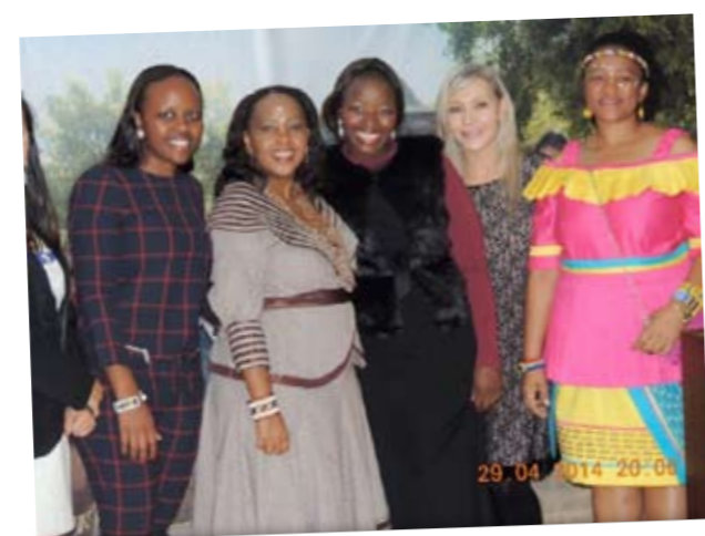
Consul-General Dube with members of the South African Consulate-General

South African ambience on the day was consolidated by the serving of traditional dishes such as samoosas, chakalaka, mogodu, tsohlo, bobotie, umngqushu, custard and jelly, South African wines and dancing to South Africa's famous old-time melodies such as Pata Pata .