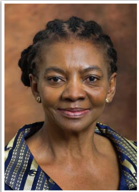
Deputy Minister Nomandia Mfeketo