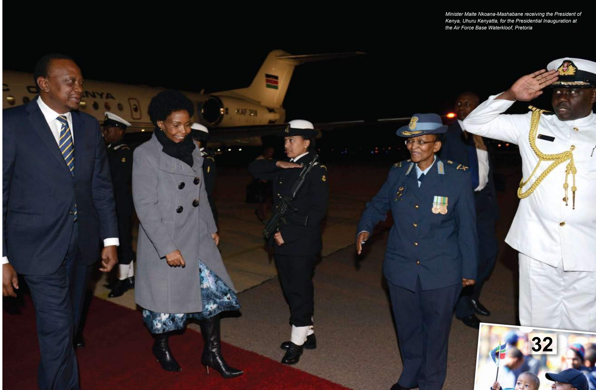
Minister Maite Nkoana-Mashabane receiving the President of Kenya, Uhuru Kenyatta, for the Presidential Inauguration at the Air Force Base Waterkloof, Pretoria