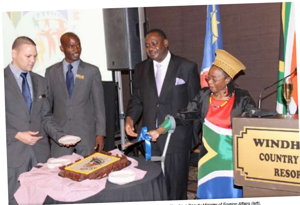
High Commissioner Myakayaka-Manzini (right) and Peya Mushelenga, Namibian Deputy Minister of Foreign Affairs (left), cutting the Freedom Day birthday cake

According to the South African High Commissioner to Namibia, Yvette Myakayaka-Manzini, after 20 years as a free and democratic country, South Africa is a better place to live in than it was in 1994. The High Commissioner was speaking at an event at the Windhoek Country Club and Resort in Windhoek to commemorate the 20th anniversary of the first democratic elections held in South Africa on 27 April 1994.