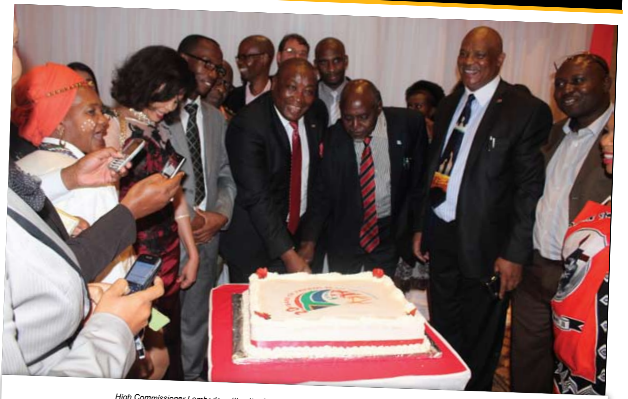
High Commissioner Lembede cutting the 20 Years of Freedom cake with Minister Skelemani

The South African High Commission in Botswana hosted its 20th Freedom Day celebrations on 29 April 2014 at the Gaborone Sun.