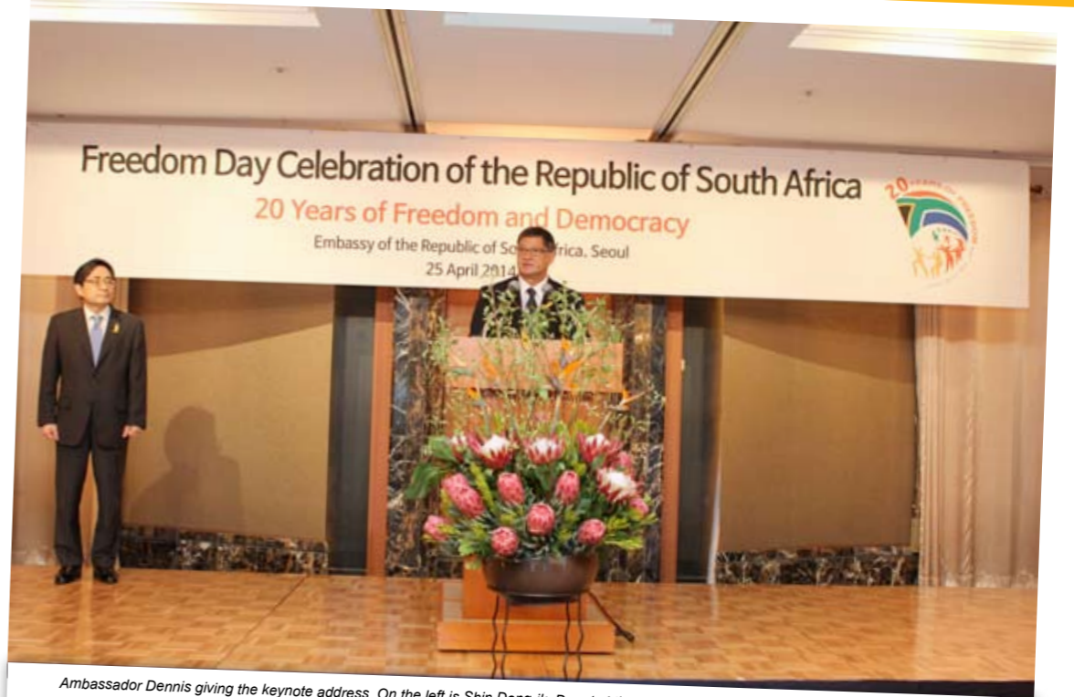
Ambassador Dennis giving the keynote address. On the left is Shin Dong-ik, Deputy Minister of Multilateral and Global Affairs of the Ministry of Foreign Affairs

The Mission in Seoul, South Korea, celebrated South Africa's 20 Years Freedom on 25 April 2014. About 200 guests attended the event, representing the Diplomatic Corps, government, business and civil society. Shin Dong-ik, Deputy Minister of Multilateral and Global Affairs of the Ministry of Foreign Affairs, represented the Government of the Republic of Korea (ROK). Two South African violinists entertained the guests during the occasion.