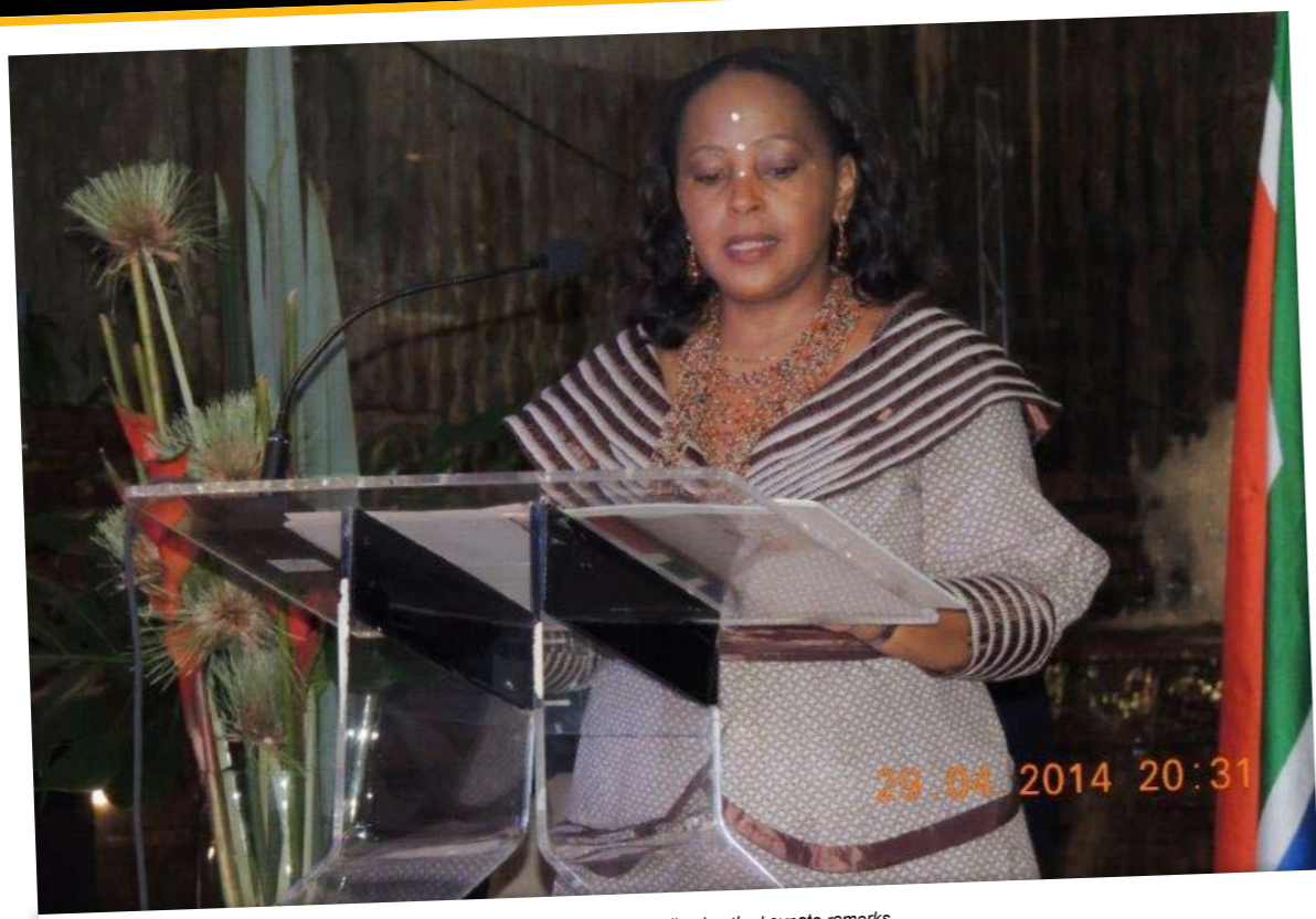
Consul-General Dube delivering the keynote remarks

The South African Consulate-General in São Paulo held its Freedom Day celebration on 29 April 2014. Invitees included members of the São Paulo State Government and Municipality, consulates-general based in São Paulo, Brazilian and South African businesspeople, academics, the South African community based in São Paulo and partners such as South African Tourism and South African Airways. Consul-General Mmaikeletsi Dube highlighted the achievements that had provided the basis for the realisation of a democratic, non-racial, non-sexist, united and prosperous South African society. The event provided a good platform to broadly share the good story of South Africa's 20 Years of Freedom and Democracy.