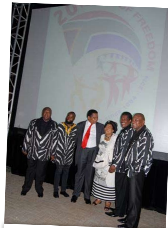
High Commissioner and Ms Qwelane with the Soweto String Quartet

The event was used to highlight and launch a series of other activities that would mark the celebration of 20 Years of Freedom and Democracy over the week of 6 to 14 June 2014. These were the South African Golf Day, the South Africa Business Exhibition and the South African Family Day. During that entire week, the Protea Kampala Hotel presented menus comprising typical South African culinary delights.