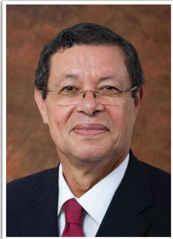
Deputy Minister Lluwellyn Landers