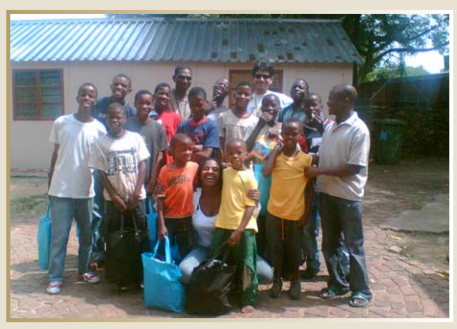
Members of Branch: Asia and Middle East with residents of the Itumeleng Shelter for Boys.