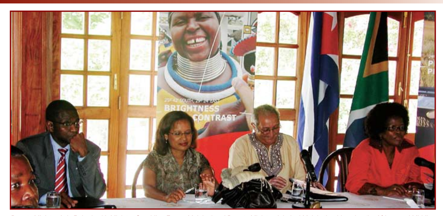
Deputy Minister Aziz Pahad, with Minister Geraldine Fraser-Moleketi and Deputy Minister Jabulani Moleketi, addressing the African and Middle East Diplomatic Corps resident in Cuba on Africa and the Middle East.

The views expressed in this newsletter do not neccessarily reflect those of the DFA or the editors.The deadline for contributiions is 15 September 2007. Contributions may be sent to cbe000 or mokhetheap@foreign.gov.za All enquiries: Paseka @ Tel: (012) 351-1569 • Fax : (012) 351-1327