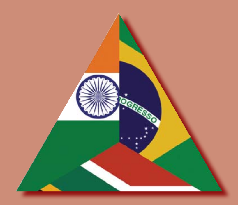
India-Brazil-South Africa (IBSA) logo

At their meeting on 17 July 2007, the Ministers discussed a wide range of global issues and reaffirmed the IBSA Dialogue Forum as an important mechanism for political consultations and coordination of positions on important international developments and issues of mutual interest. The Ministers reconfirmed their determination to play a constructive role in international affairs as three emerging economies of the South and to