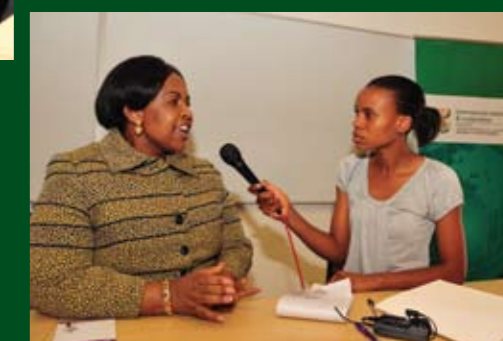
Minister Maite Nkoana-Mashabane during an interview