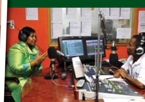
Below: Minister Maite Nkoana-Mashabane taking part in a radio interview