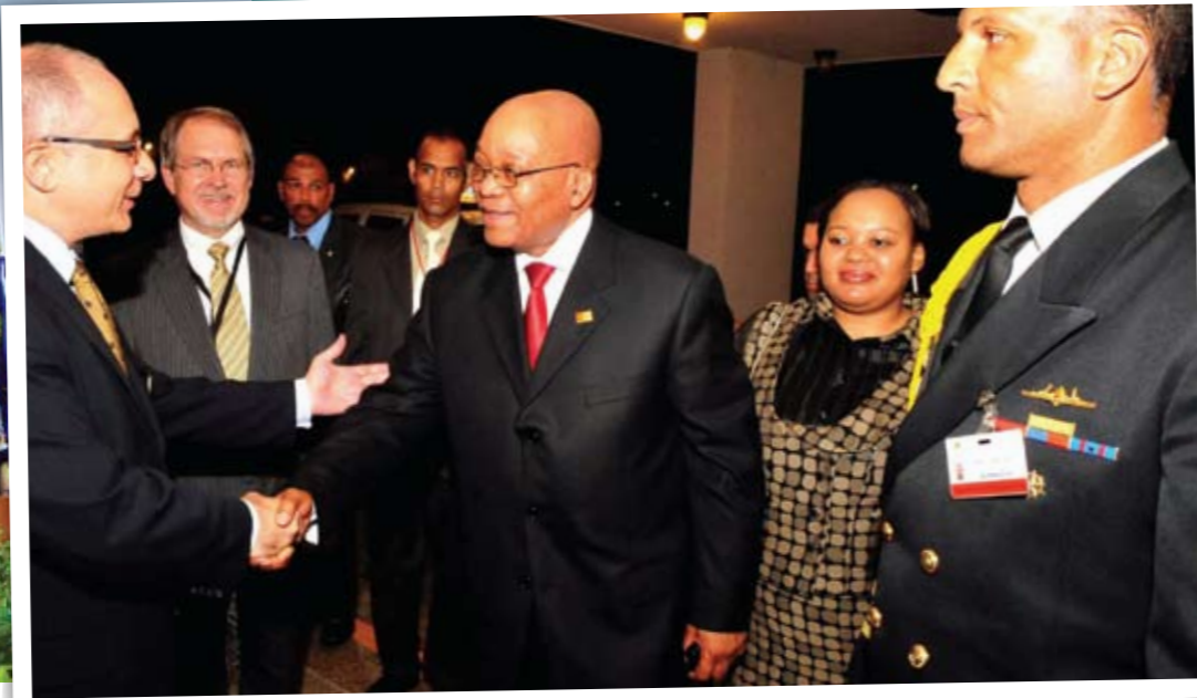
Far left: The Opening of ASA Summit in Venezuela