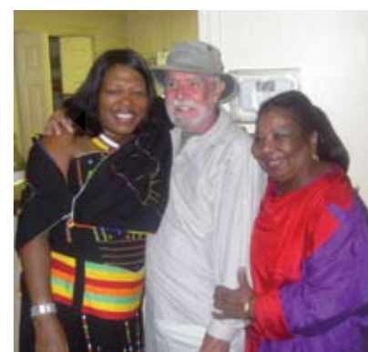
Consul-General with Athol Fugard