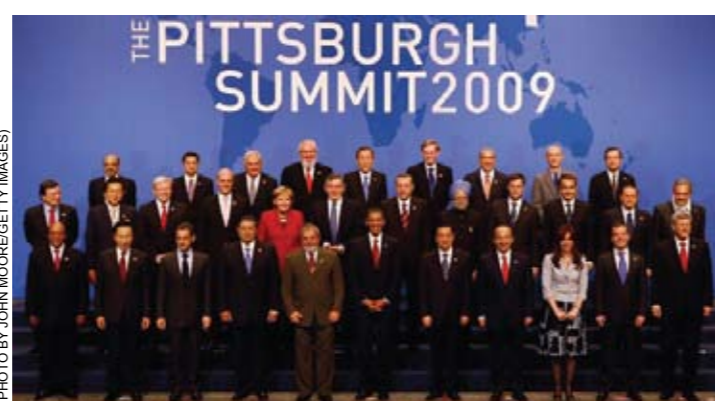
▲ World Leaders at the G-20 summit held at the David L. Lawrence Convention Center, aimed at promoting economic growth