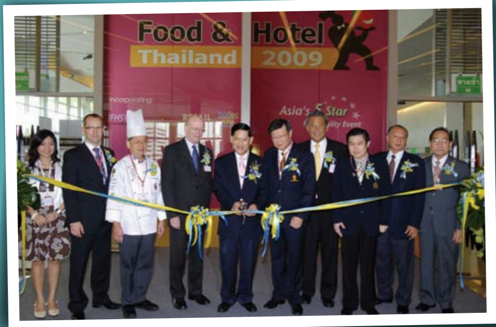
▲ The opening of the Food and Hotel 2009 Expo

C humpol Silapa-Archa, Thailand's Minister of Tourism and Sports, opened Food and Hotel Thailand 2009 – the number one event in Asia for the hospitality industry's premium market supply of international food, beverage, equipment and technology which was held at the Royal Paragon Hall, Bangkok from 2 – 5 September 2009.