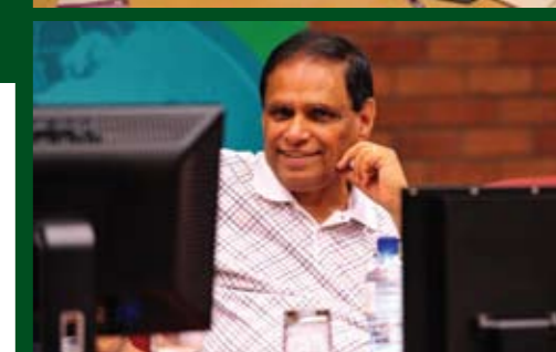
▲ Dep Minister Ebrahim at Imbizo