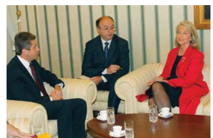
▲ Ambassador Sheila Camerer with Bulgarian President Georgi Parvanov during her credentials ceremony, Bulgaria

In response I referred to President Jacob Zuma's visit to Bulgaria as Deputy President in 2000 and expressed the hope that he would be able to come for a repeat visit as President during President Parvanov's term of office. ■