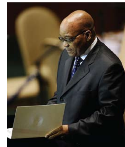
▲ President Jacob Zuma speaking at the 64th General Assembly at United Nations Headquarters in New York

proceeded to Pittsburgh, Pennsylvania, USA, for the G20 Summit. ■