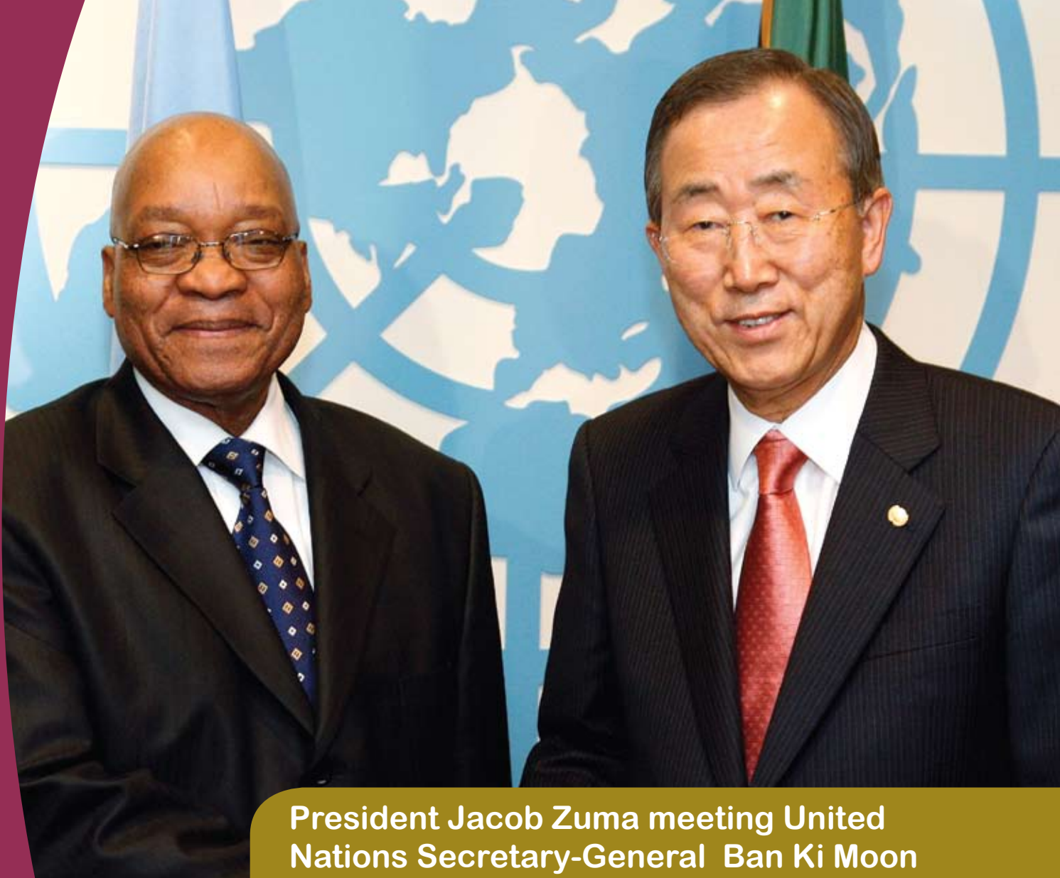
President Jacob Zuma meeting United Nations Secretary-General Ban Ki Moon