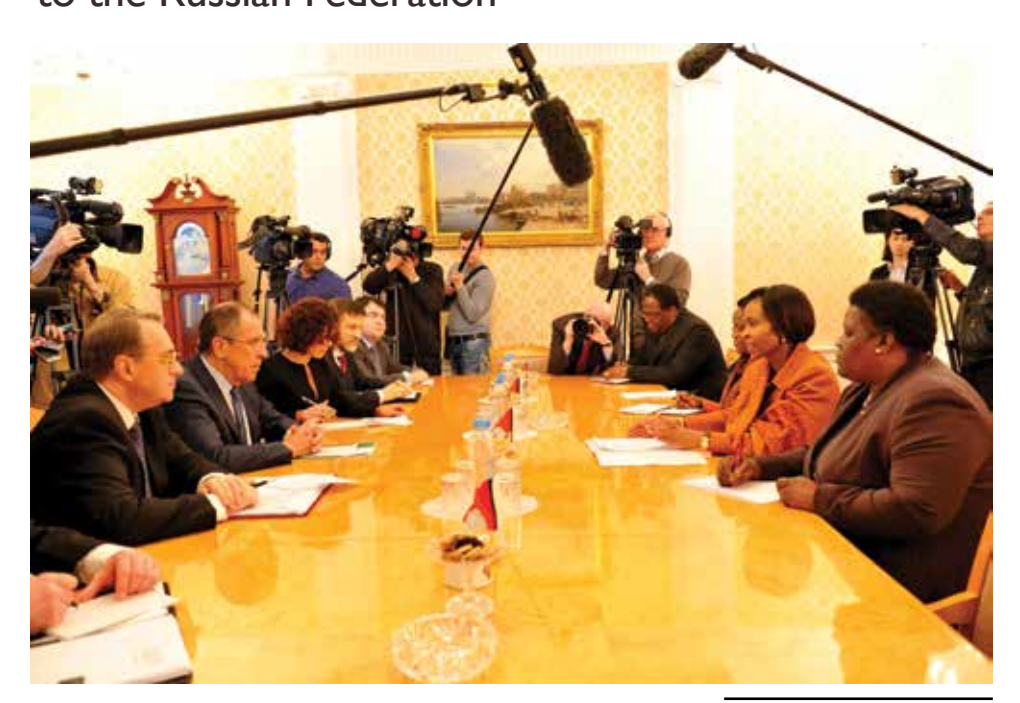
Minister Maite Nkoana-Mashabane with Sergey Lavrov, the Minister of Foreign Affairs of the Russian Federation

The Minister of International Relations and Cooperation, Maite Nkoana-Mashabane, paid a successful Working Visit to the Russian Federation on 12 November 2015. The purpose of the visit was to co-chair the 13th Session on the annual South Africa-Russia Joint Intergovernmental Committee on Trade and Economic Cooperation (ITEC) with the Minister of Natural Recourses and Environment of the Russian Federation, Sergey Donskoy.