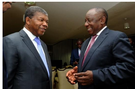
President Cyril Ramaphosa and President João Lourenço of the Republic of Angola at Bole International Airport in Addis Ababa, Federal Democratic Republic of Ethiopia, ahead of the SADC Double Troika Summit