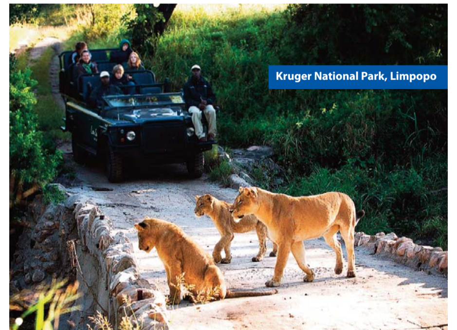
Kruger National Park, Limpopo

surroundings. Whether you are looking for something specific, have time on your hands to browse around or just love to shop, the boutiques, chain stores and specialist shops in the country's malls have it all. When you leave the country after your holiday or business trip, you will lament the baggage restrictions of the international airlines and wish that you could take more of South Africa home with you! Thanks to a very favorable exchange rate, Euros or US Dollars go a very long way in South African shopping centers, and make even the more exclusive purchases very affordable.