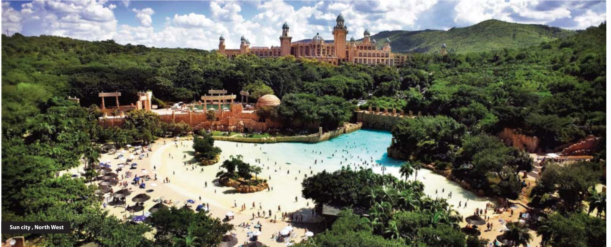
Sun city , North West