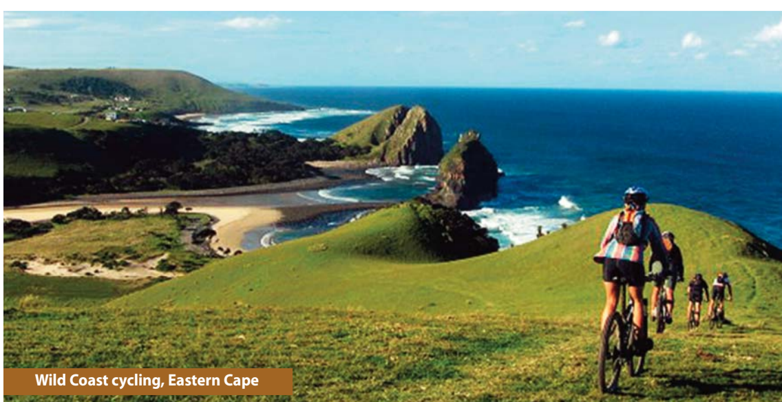
Wild Coast cycling, Eastern Cape

South Africa's natural and scenic beauty, good climate, abundant wildlife, diverse flora and fauna, stunning landscapes and fascinating history, and culture are major tourist attractions that have grown globally to make South Africa an iconic, 'must do' tourism destination and experience. South Africa is infused with a multicultural vibrancy. This mix of cultures makes our country open and welcoming to nations across the world. South Africa is a Muslim friendly country and encourages Muslims to travel to beautiful South Africa and learn about the country's history and heritage including over 200 years of Islam on these shores.