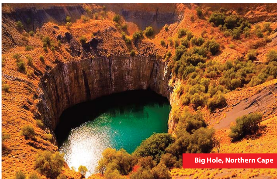
Big Hole, Northern Cape