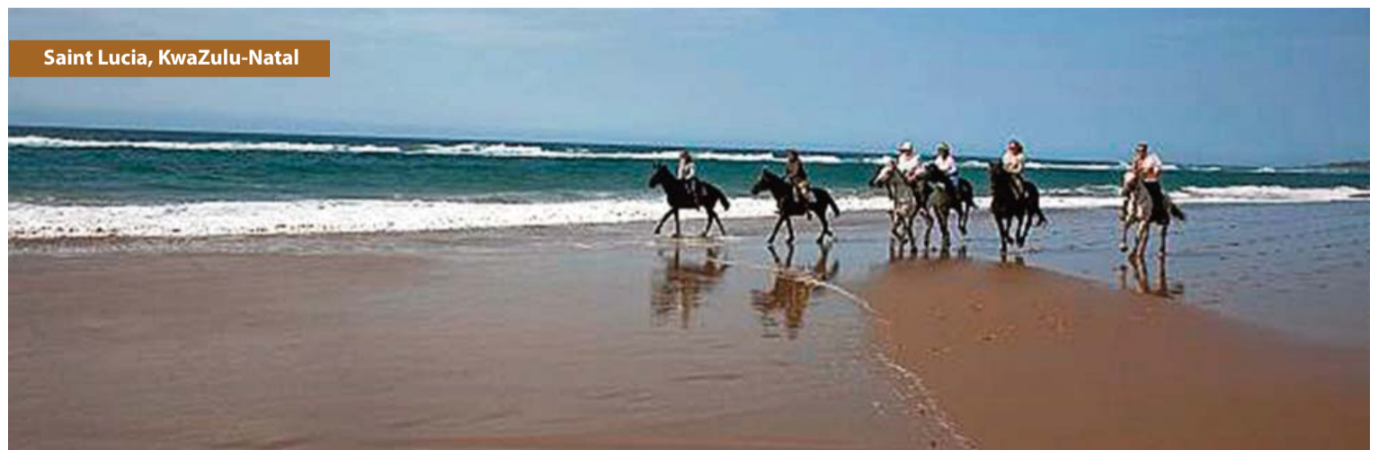
Saint Lucia, KwaZulu-Natal

For cultural connoisseurs, you will be spoiled for choice with a range of cultural offerings from theatre, poetry, dance, and world class art galleries, a variety of music venues and concerts, and diverse architecture and archaeology, village and townships tourism, etc. Some of the significant cultural attractions include the fossil-bearing caves forming part of the Cradle of Humankind in Gauteng, the ruins of the Kingdom of Mapungubwe in northern Limpopo, the wine routes of the Western Cape, and various historical sites in the cities of Cape Town and Johannesburg (such as Robben Island, the Castle of Good Hope and Soweto township). Eight South African sites are inscribed on the UNESCO World Heritage List, including the iSimangaliso Wetland Park and uKhahlamba Drakensberg Park in KwaZulu-Natal.