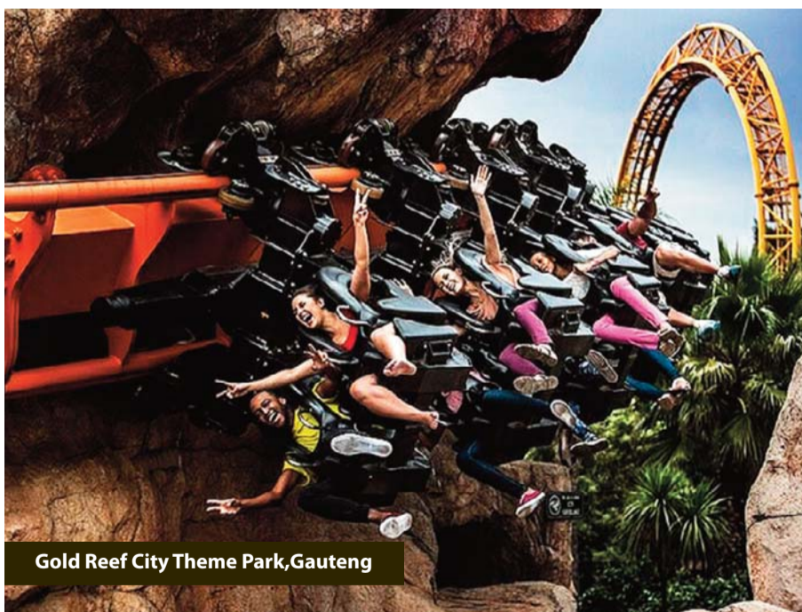
Gold Reef City Theme Park, Gauteng