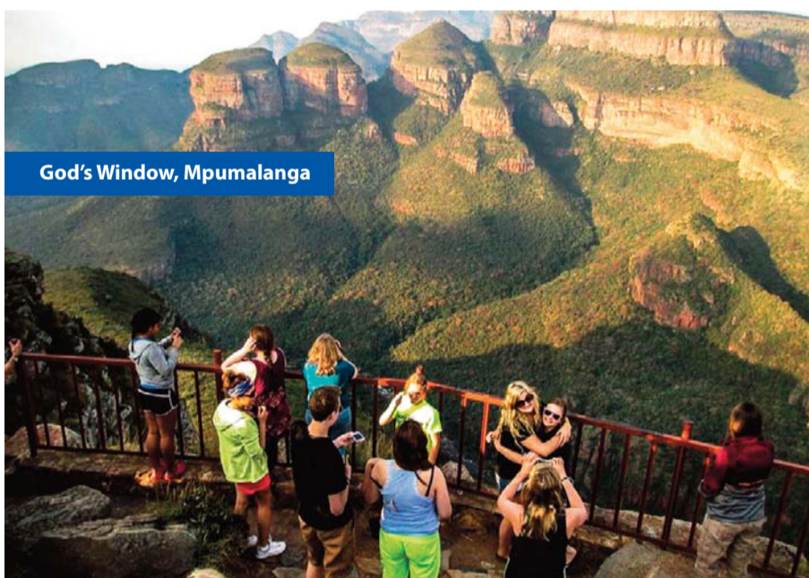
God's Window, Mpumalanga