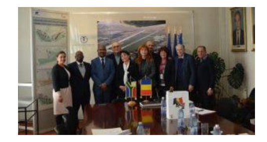
South African Embassy delegation met with the Prefect of Cluj county and was warmly welcomed by Cluj Chamber of Commerce and Industry.