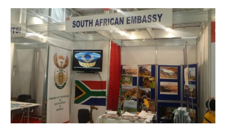
South African Embassy's stand at 2018 Tourism Fair attracted lots of visitors who came to enquire about South African destinations.