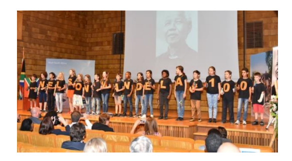
Nelson Mandela Centenary was celebrated with video memories, children choir songs, painting exhibition and reception at Bucharest Art Museum.