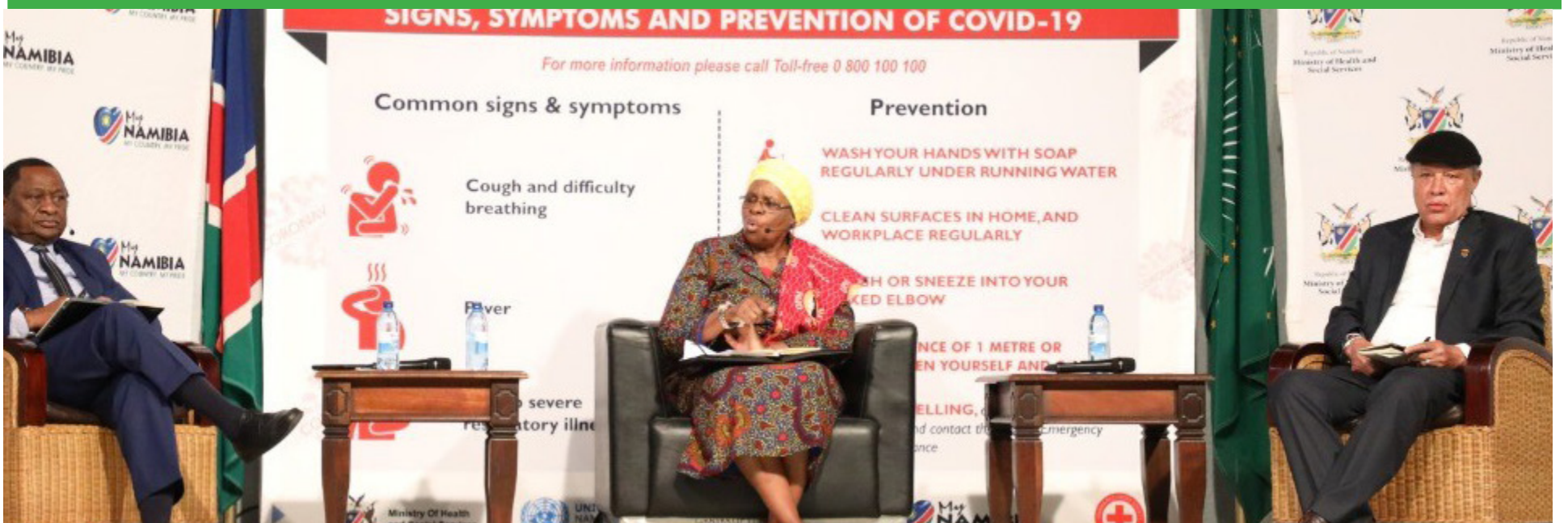
From left to right: Minister of Health and Social Services Hon. Dr Kalumbi Shangula, Deputy Prime Minister and Minister International Relations and Cooperation Hon. Netumbo Nandi-Ndaitwah and H.E Archie Whitehead discussing African government response to Covid-19.