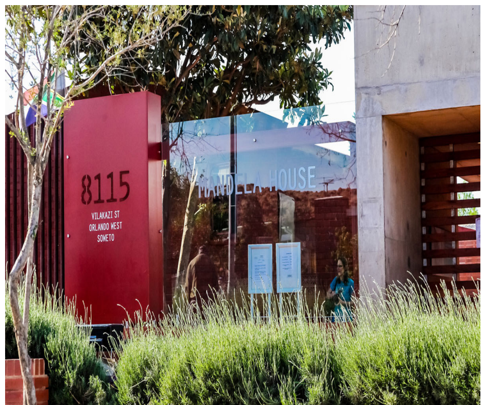
Mandela House Museum