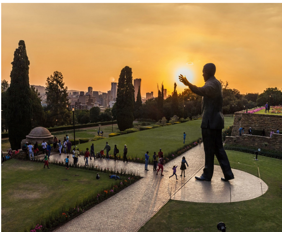
Union Buildings: Statue of Nelson Mandela

A trip to Tshwane, also called the Jacaranda City in spring will showcase the glorious purple blossoms of the Jacaranda tree in early Spring. On your list should be a visit to the Union Buildings which will leave you in awe at the Statue of Nelson Mandela in the park grounds and you can do an outing to see diamond mines when visiting the quant town of Cullinan. Last, but not least a trip to the popular Gold Reef City allows you to step back in time and see the old mine town whilst being invited to pick up a gold bar!